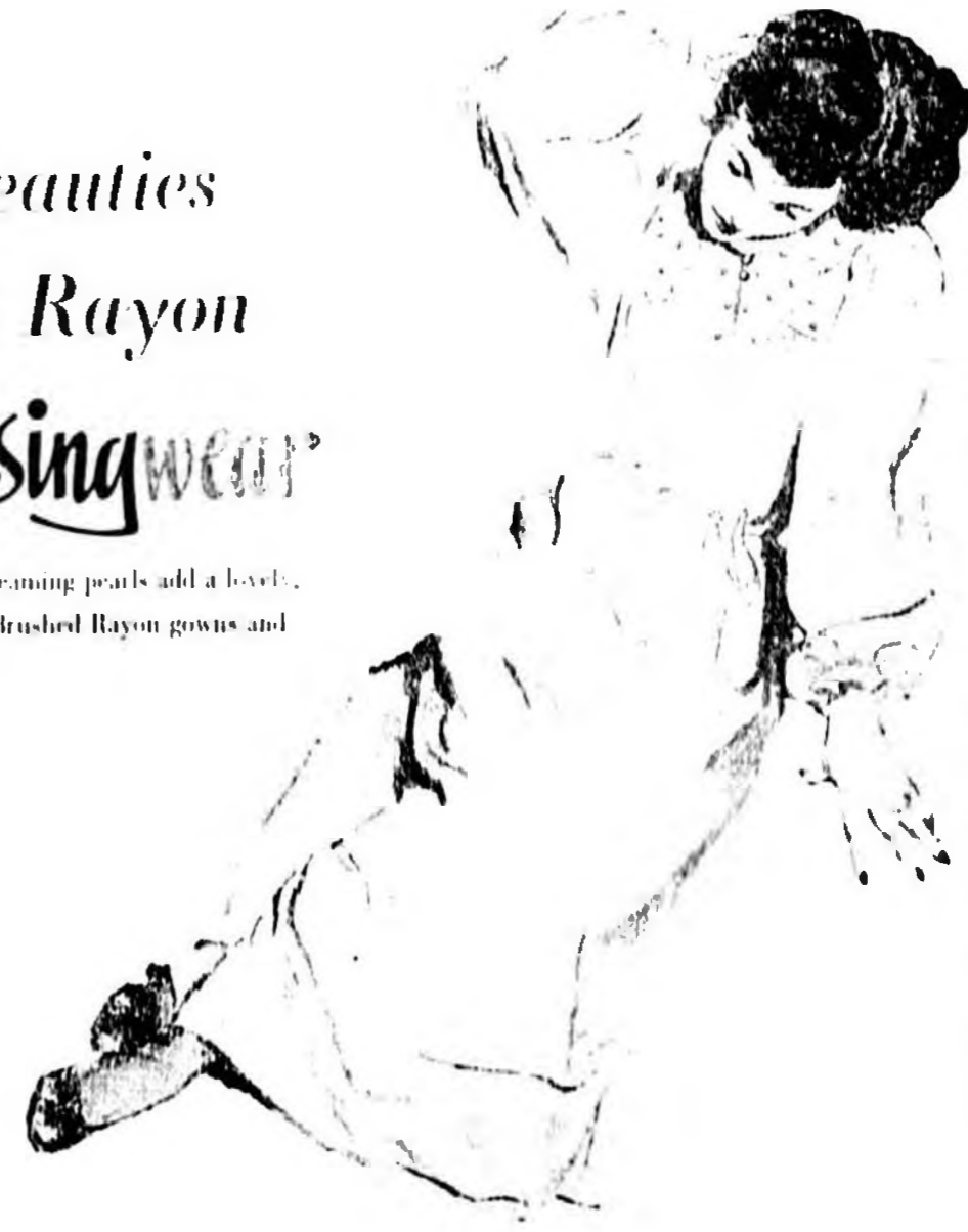
Dreamy aqua, horizon blue, dawn coral, nap pink. 14-20