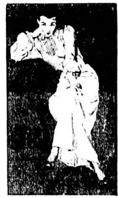
Blue heaven, coral sunset, pink dawn, yellow sunshine 11-20

Balbriggans are warmly fashioned of fine combed cotton and are knit and finished to resist shrinking, sagging, stretching.