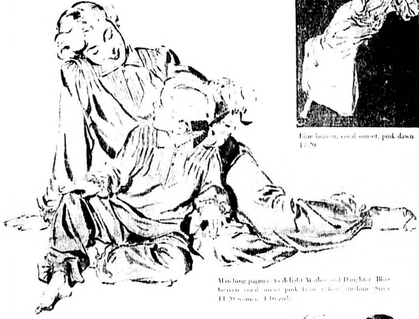
Matching pajamas to delight Mother and Daughter. Blue heaven, coral sunset, pink dawn, yellow sunshine 11-20 women, 11-6 girls.