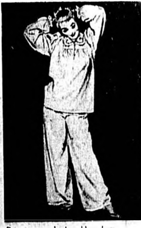
Dreamy aqua, horizon blue, dawn coral, nap pink. 14-20

sprinkled with pearls — dainty, gleaming pearls add a lovely, feminine touch to downy-soft Brushed Rayon gowns and pajamas. Wonderfully warm to wear.