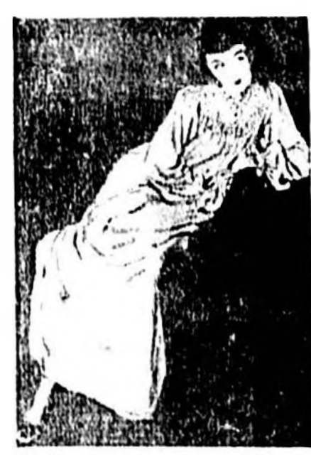
Blue heaven, coral sunset, pink dawn 11-20