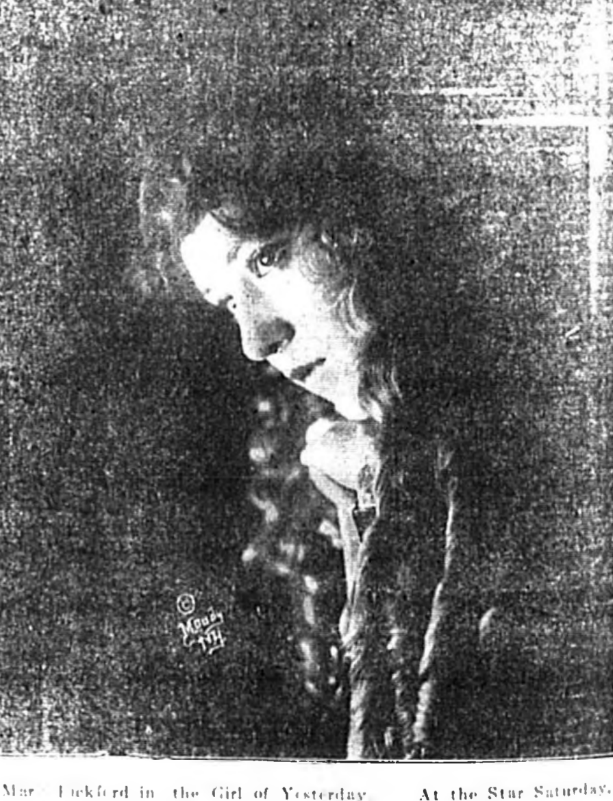
Mrs. Pickford in the Girl of Yesterday at the Star Saturday.