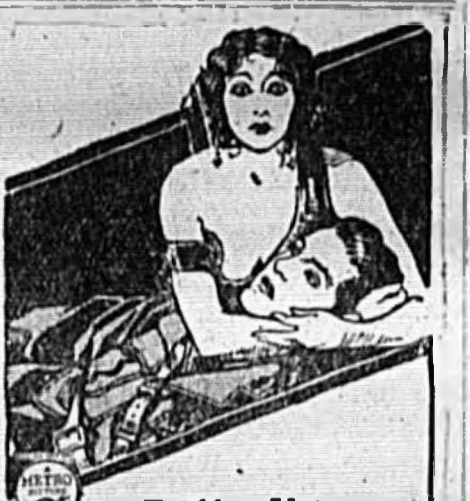
Faithless Unto Death. Zareda's one constancy was her fickleness. And for it life closed in upon her and made her pay.

TALLAHASSEE, March 20.—Railway property returns for the year 1923, were presented and argued by approximately a score of representatives of the carriers before the railway assessment board yesterday. The five principal roads operating