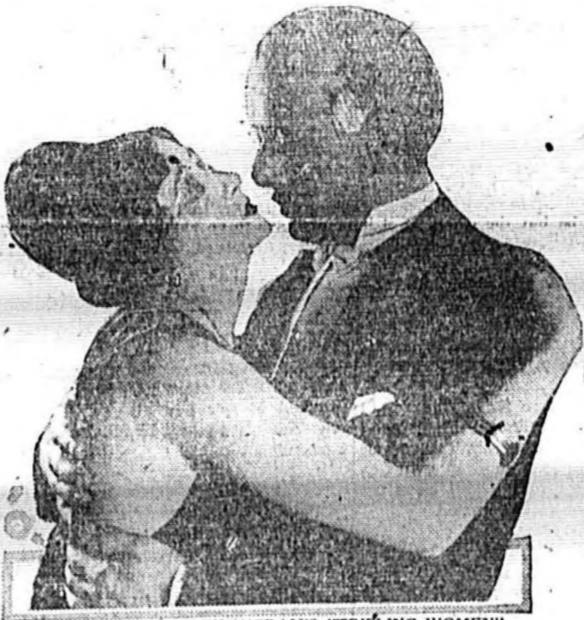
LAST TIMES TODAY AND TONIGHT AT THE PRINCESS