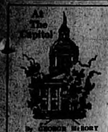
As The Capital

TALLAHASSEE, July 5, 1931.—Tuesday morning, at 10 o'clock, there will convene in the Capitol, the first joint extra session ever held in the history of our fair state.