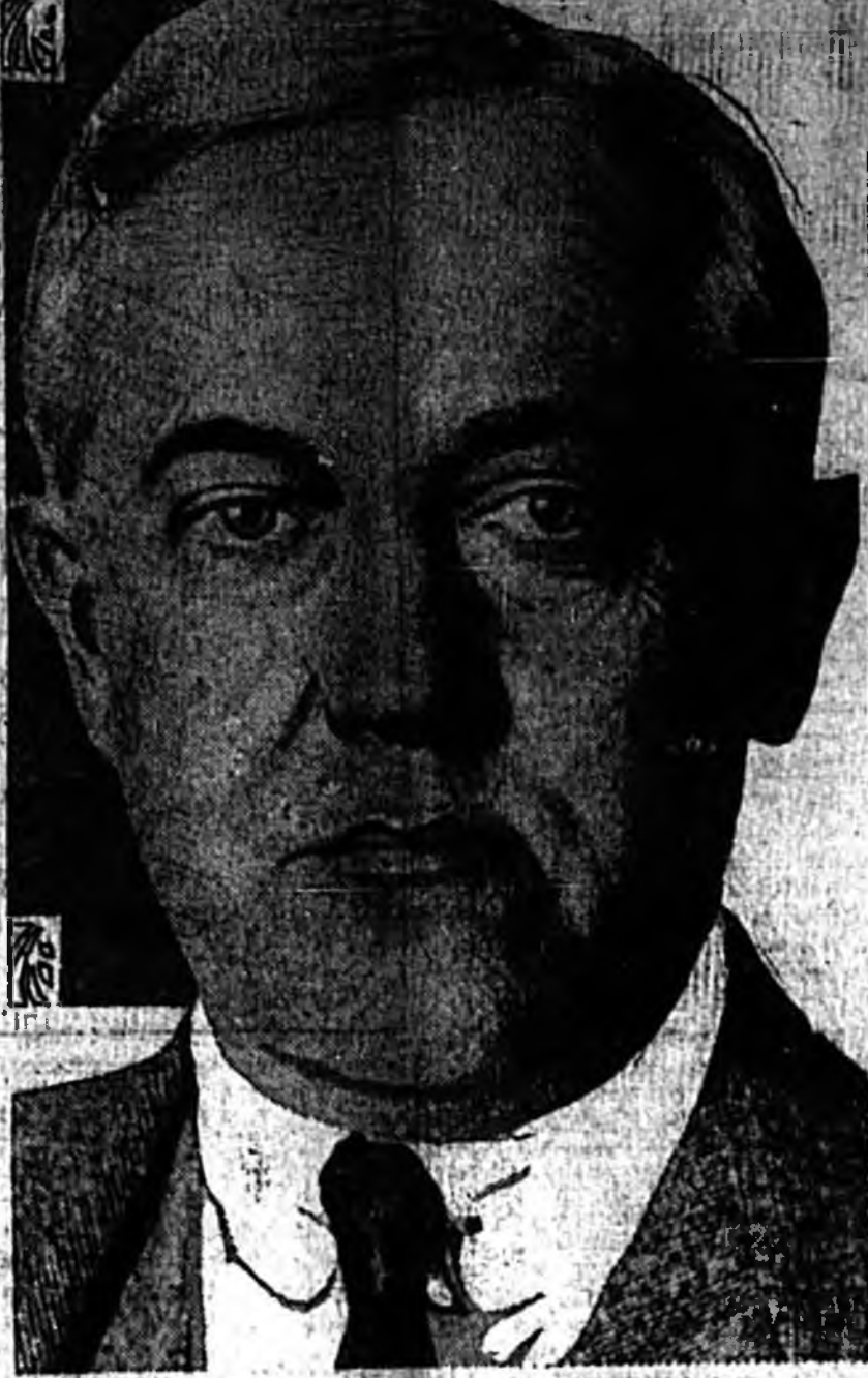
John W. Davis, Democratic nominee for the presidency, who in his speech of acceptance at the notification ceremony Monday night, declared that the coming campaign will be waged with "no gloves on."

U. S. CRUISER IS SCOUTING FOR GLOBE ARMEN Raleigh is Seeking Place For Globe, Girdlers to Land On Their Hop-off From Iceland