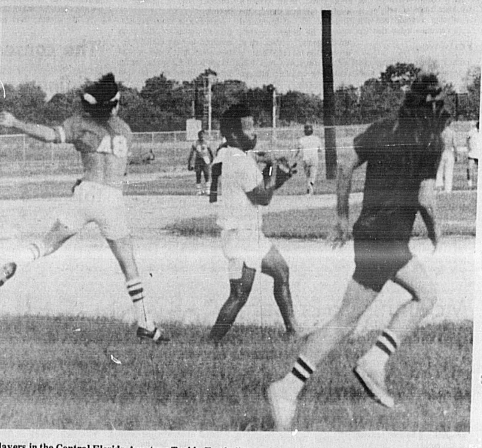
Players in the Central Florida Amateur Tackle Football League get it together on an Ahiomonte field.