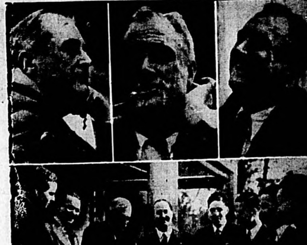
Noted by his spring vacation at Warm Springs, President Hoover got out under a warm Georgia sun today to catch up on a little work, and receive a group of Georgia students. The would-be crowd in the school building in Hot Springs, Ark., was broken up by the arrival of the president.