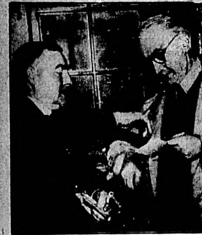
A military inquiry into the New London, Tex., school explosion ended with the opinion of Dr. E. J. Hech, explosion expert, that escaped gas under the basement floor caused the blast that took the lives of 35 students and teachers. School (right), shown at the inquiry last week, exploded when a gas leak from a pipe under the basement floor caused the blast.