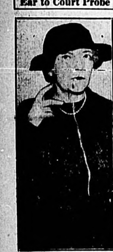
Pulling a cigarette in jaunty fashion, Mrs. Alice Roosevelt Longworth listened intently at a hearing before the Senate Judiciary committee. She is an unrepentant critic of the President's foreign policy.