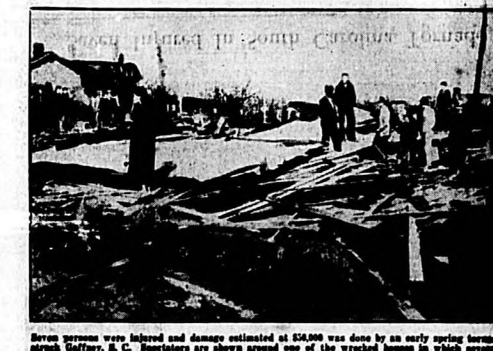
Seven persons were injured and damage estimated at $50,000 was done by an early spring tornado in South Carolina. The photograph shows a scene of destruction in which several houses were blown away and others damaged.