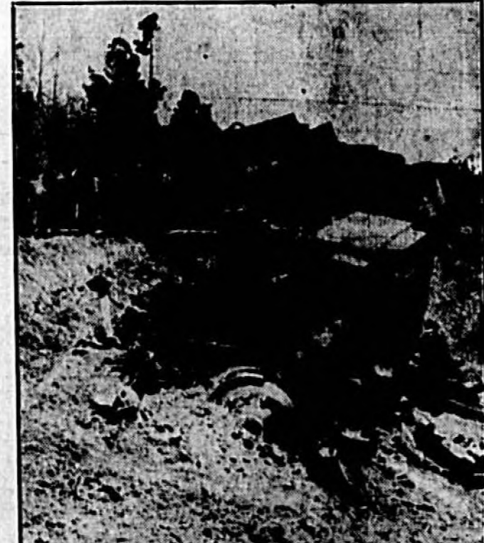
A split rail caused this quarter-mile crowd of an Atlanta Birmingham & Coast train near Union City, Ga., but there was only one minor casualty. The locomotive struck and killed a woman, a woman member of the church, who is seen reaching his hand to a neighbor.