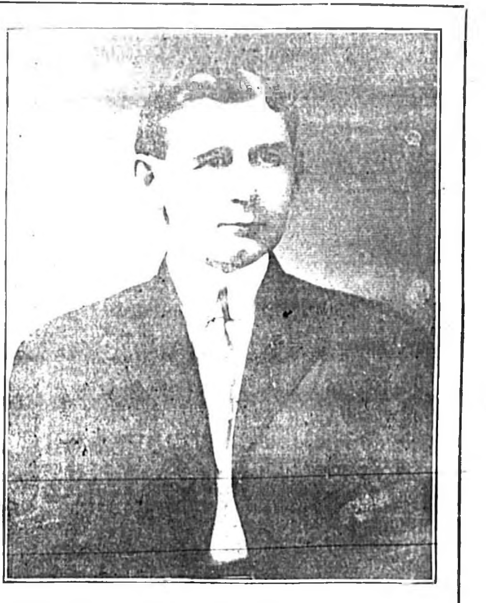
W. J. SEARS, Representative in Congress.