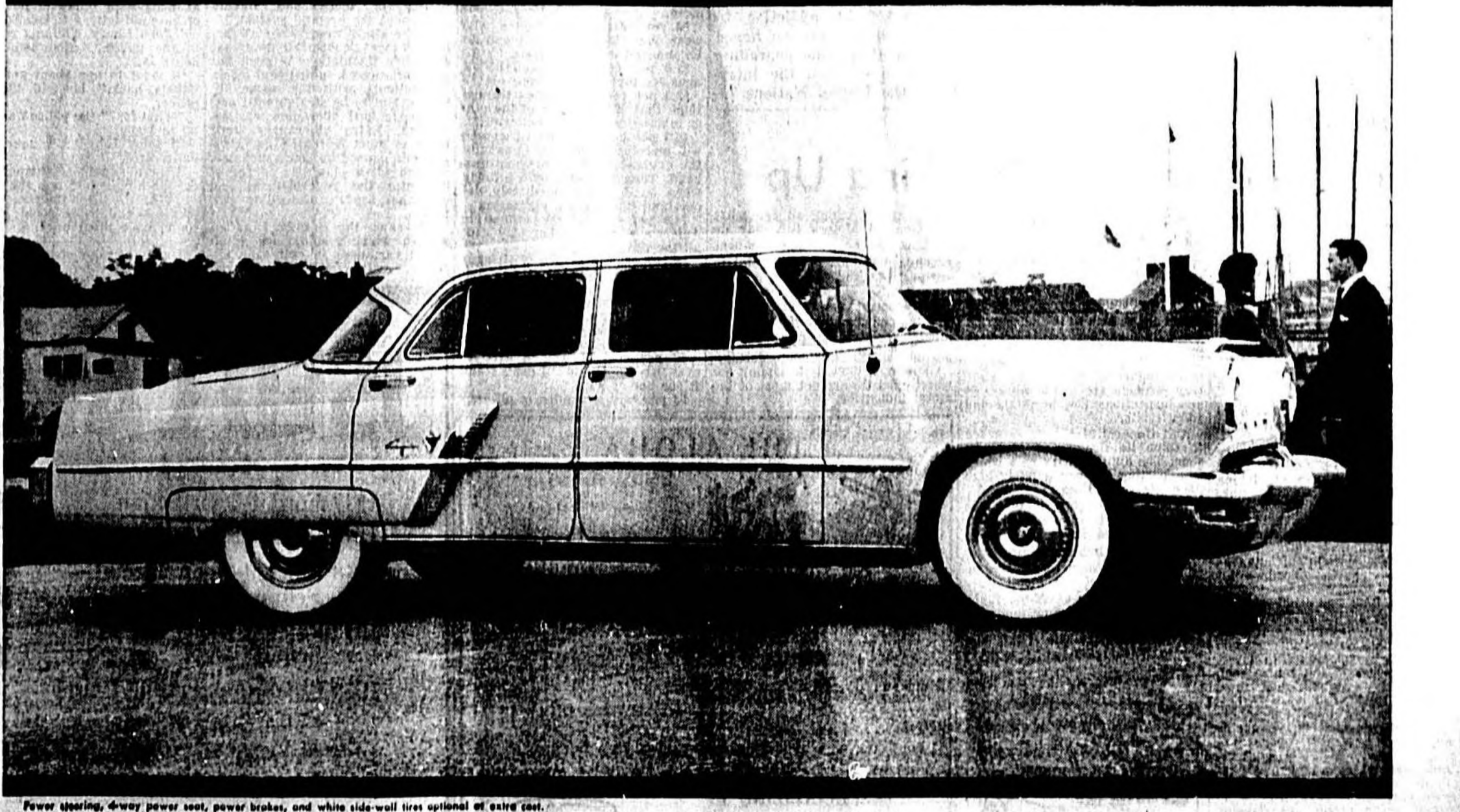
Power steering, 4-way power seat, power brakes, and white side-wall tires optional at extra cost.

Imagine yourself whisking along the highway relaxed in your favorite easy-chair. That's how you feel in the new Lincoln enjoying its new concept of luxury driving with power brakes, power steering, and the 4-way power seat. And you thrill to Lincoln's 290-horsepower engine, an exciting blend of champion enhance (Lincoln took best four stock car places in the Mexican Pan-American Race) and champion efficiency (Lincoln won first place in the time trials in the Mobilgas Economy Race). And you talk with your Lincoln from time to time, plus the most dramatic interior, complete with day-long room. After you've taken a look, you'll know that Lincoln's the one-line car designed for modern living and completely powered for modern driving. See it soon in our showrooms.