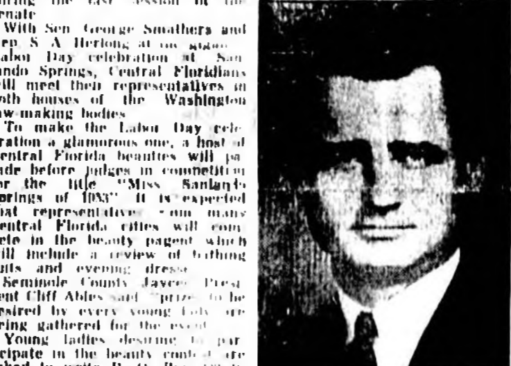
SEN. GEORGE SMATHERS

Sen. George Smathers of Florida is expected to attend the Jaycee sponsored Sanlando Springs Fete. The all-day celebration will be held at the Sanlando Springs Hotel and will feature a parade, a band, and a variety of other activities.