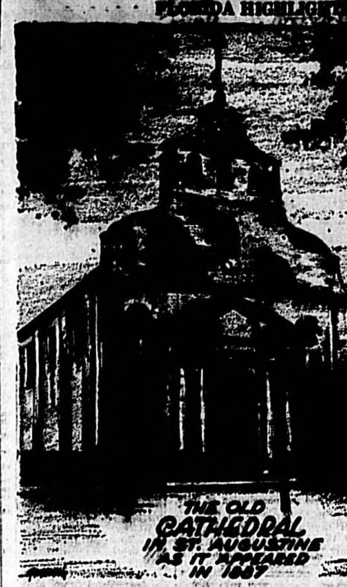
THE OLD CATHEDRAL IN ST. AUGUSTINE AS IT APPEARED IN 1697