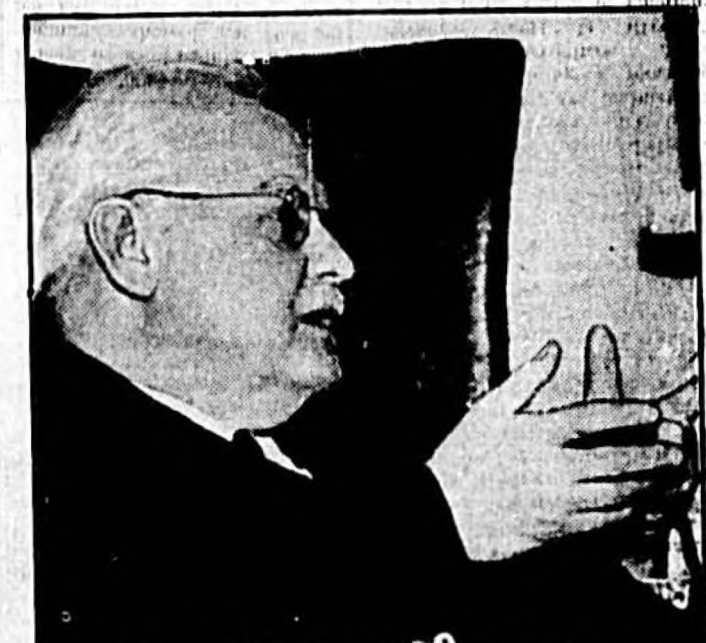
Stirred anew at the biting criticism of Chancellor Adolf Hitler by Mayor LaGuardia of New York and the anti-Nazi outburst at a Manhattan mass meeting, Dr. Hans Luther, the Reich ambassador, curtly explained his protest to Secretary of State Hull. The ambassador is seen explaining his stand in Washington newspaper men just before seeing Hull.