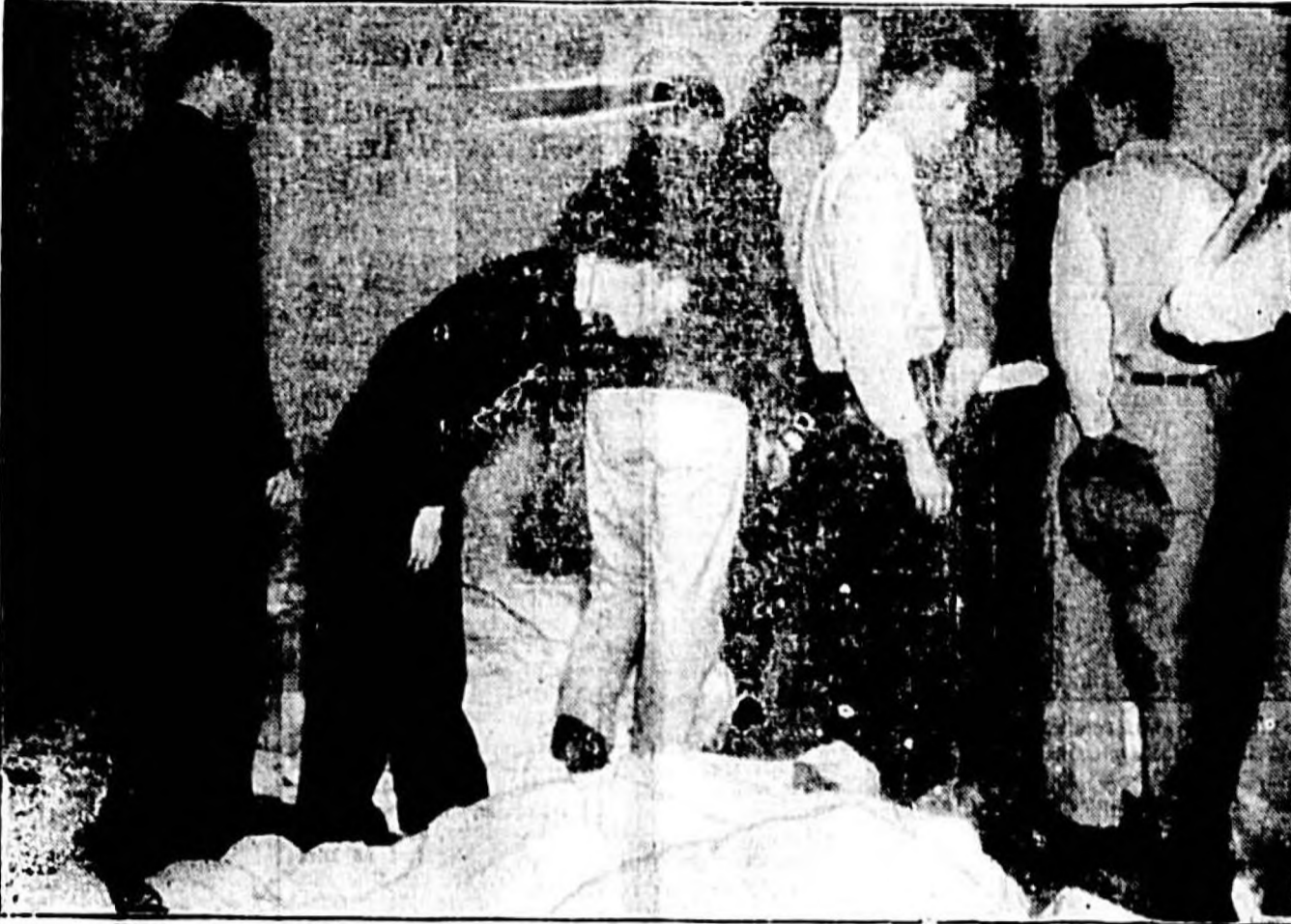
Parents of school children killed in the tragic explosion at New London, Texas, are shown here past a row of mutilated bodies in cases of their own. It was estimated 670 pupils and teachers perished in the mysterious blast that blew the new Consolidated school to bits. More than 200 bodies were found shortly after the tragedy.