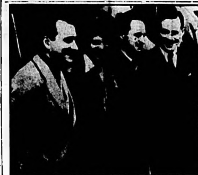
Amelia Earhart and two of the three men of her crew narrowly escaped death when her "flying laboratory" cracked-up in taking off from Honolulu on the second leg of her proposed world flight.