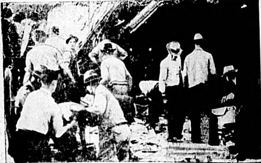
This pathetic picture shows relief workers bringing the body of a boy from the ruins of the New London, Texas, Consolidated school which was wrecked by a strange explosion. The youth was one of 300 whose bodies were found soon after the blast. School authorities believe 670 pupils and teachers were killed.