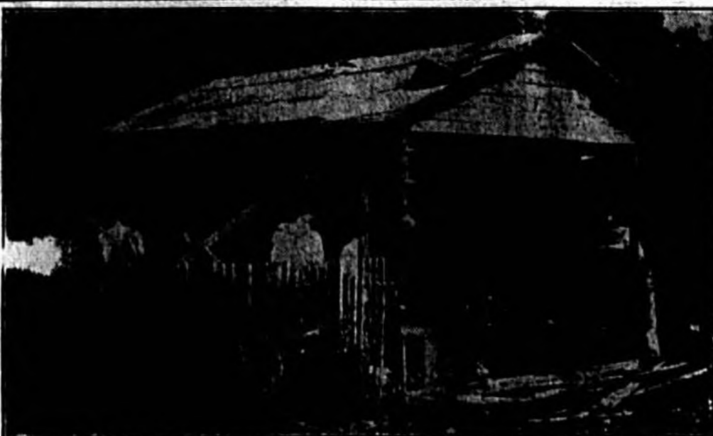
This is the way Bruno Richard Hauptmann's garage in the Bronx looked during the latest stages of its demolition by police wreckers. It was decided to take the flimsy structure apart plank by plank, after a second cache of ransom money, concealed in holes drilled in a two-by-four, was found. Shortly after this photograph was made there wasn't a stick standing.