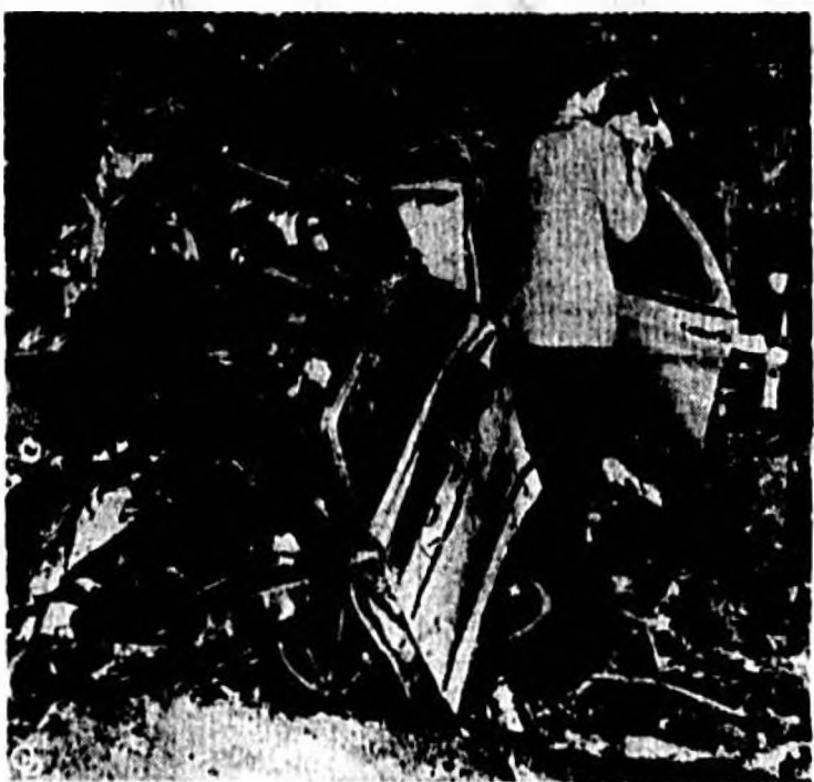
KILLED INSTANTLY when their car crashed at 100 miles an hour at East Norwich, New York, the bodies of four Long Island youths lie in the splintered wreckage while a priest (right) administers last rites over a mangled body that was thrown from the car. The demolished auto burst a 15-foot embankment after smashing through a light pole, four trees and seven concrete highway guard posts.