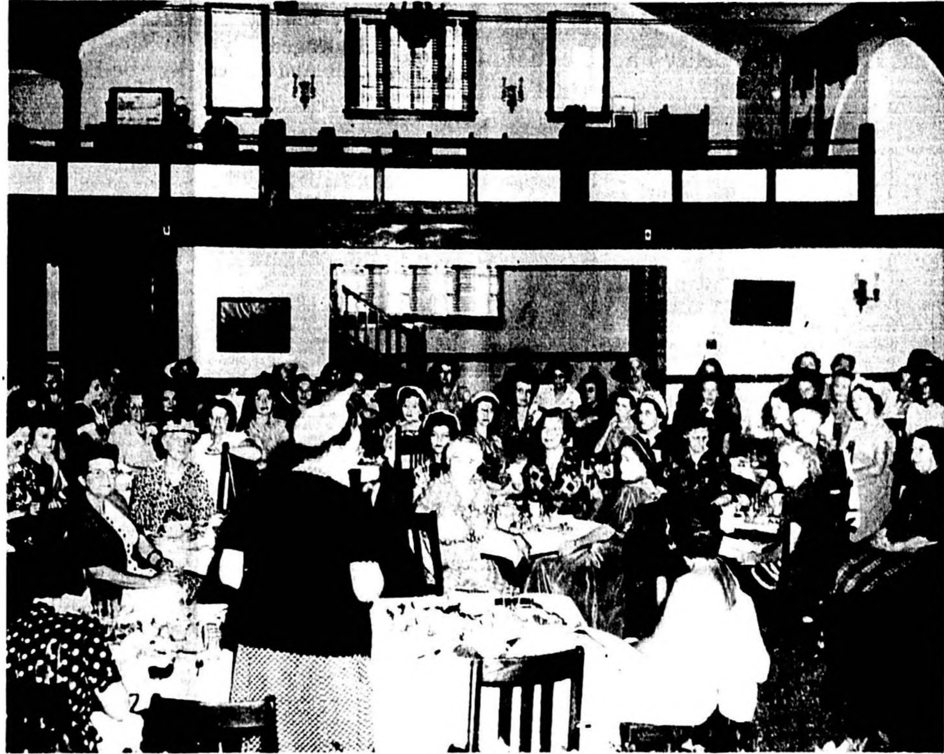
Members of the Sanford Women's Club gather each month of the Fall and Winter season at their club house for a luncheon and general business meeting.