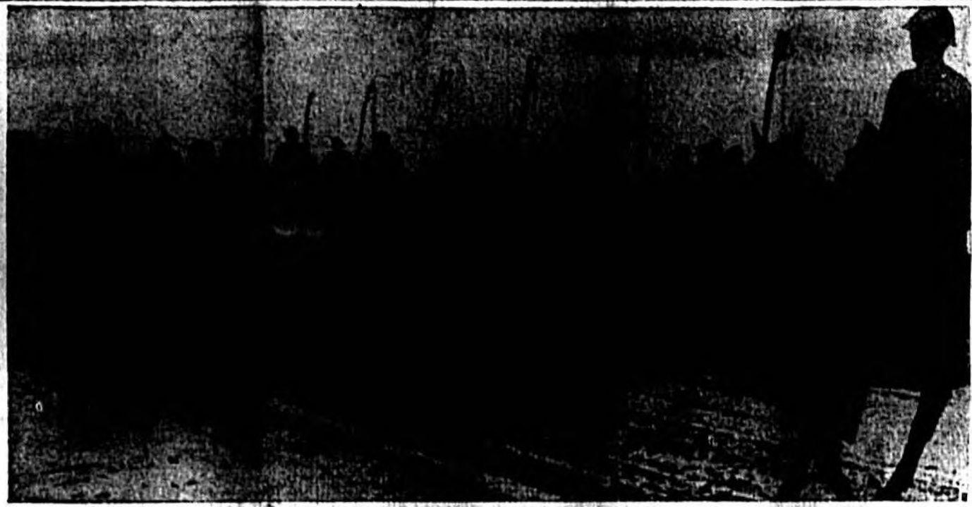
The men and guns of the Yugoslav artillery are good. The country has plenty of these tough soldiers, but no surplus of guns or ammunition. Horses and donkeys can haul the guns through mountain paths where Nazi Panzer divisions may not even attempt to follow.