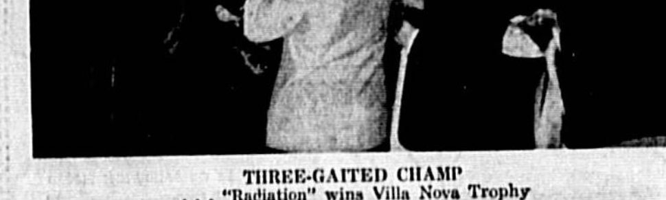
THREE-GAITED CHAMP ... "Radiation" wins Villa Nova Trophy