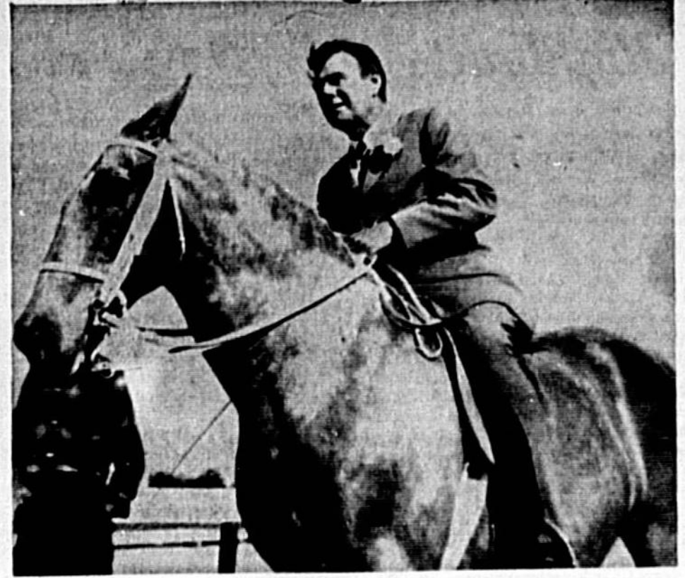
ARTHUR GODFREY ... With his Arabian Stallion, Goldie