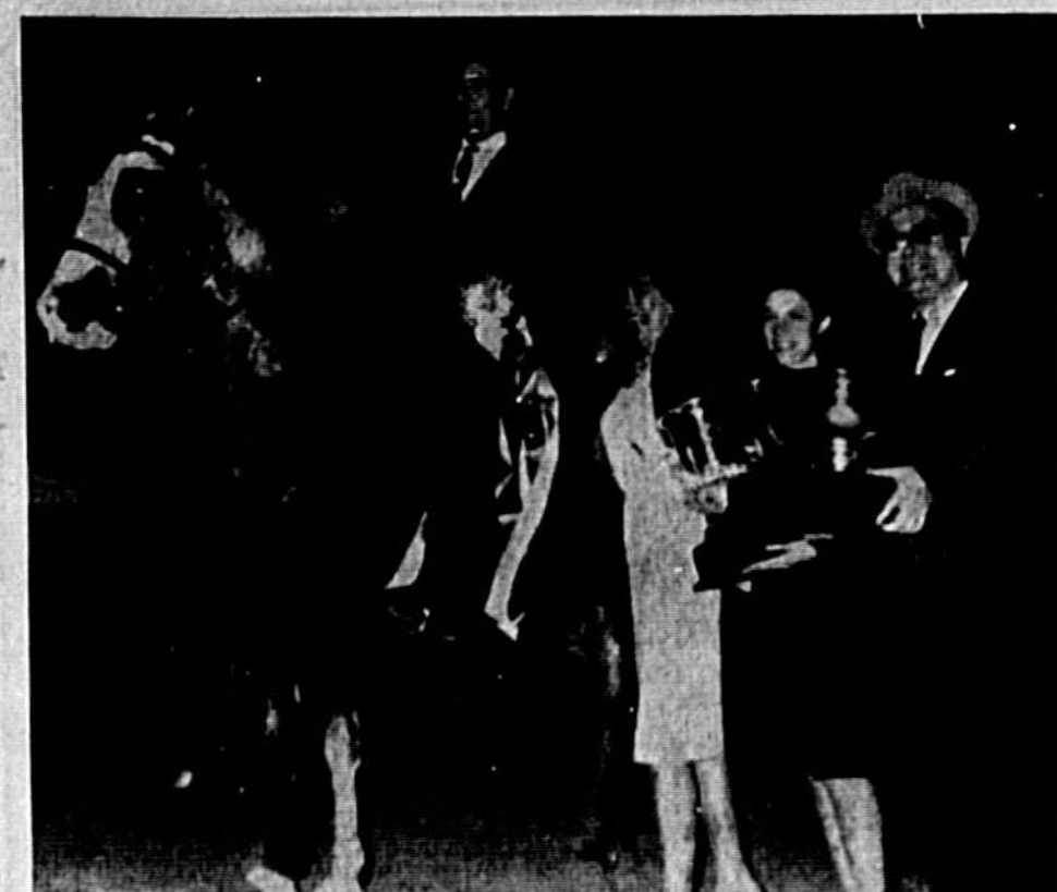
SILVER SHADOW'S REPLICA ... Winner of $2500 Walking Horse Stake