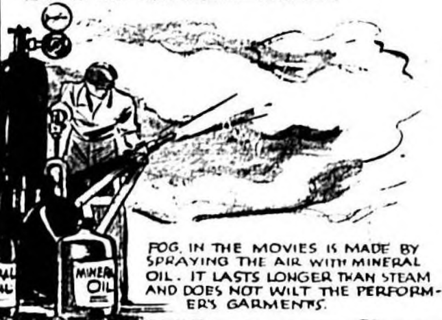
FOG IN THE MOVIES IS MADE BY SPRAYING THE AIR WITH MINERAL OIL. IT LASTS LONGER THAN STEAM AND DOES NOT WILT THE PERFORMER'S GARMENTS.