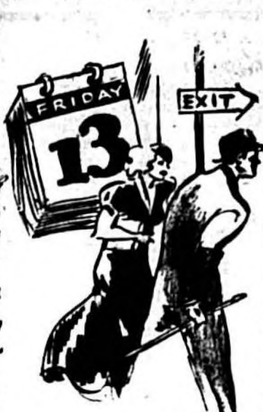
SUPERSTITIOUS ACTORS! PHOTOGRAPHING "FOG" HAD TO BE STOPPED FOR A DAY BECAUSE THE ACTORS REFUSED TO APPEAR IN EVEN A "MOVIE" SEANCE ON FRIDAY THE 13th.