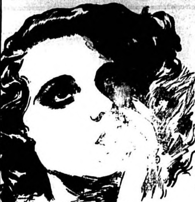
A MOVIE ACTRESS SHUNS STARDOM! MARY BRIAN FEATURED IN FOG DOES NOT DESIRE STARDOM. SHE SAYS AFTER YOU REACH THE TOP THE ONLY ROAD LEFT IS THE WAY DOWN—AND OUT!