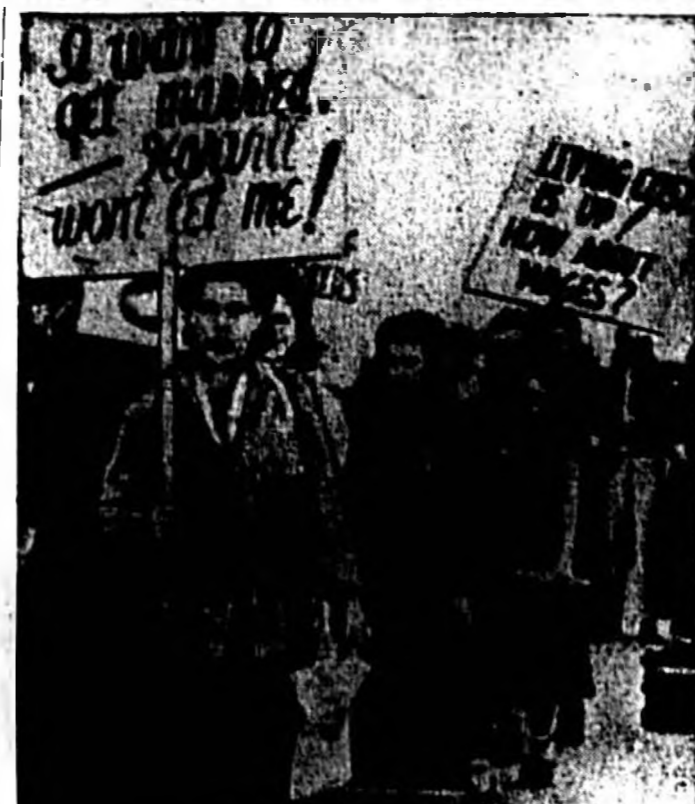
These women are not standing idly by while their men are out on strike at the Harrell Die Casting Company in Los Angeles. They are shown picketing the plant which is engaged in the manufacture of equipment necessary in the construction of airplanes. This was one of the plants cited by Office of Production Management as delaying plans output.

The Associated Press said that the United States Navy is providing a precedent with the Axis.