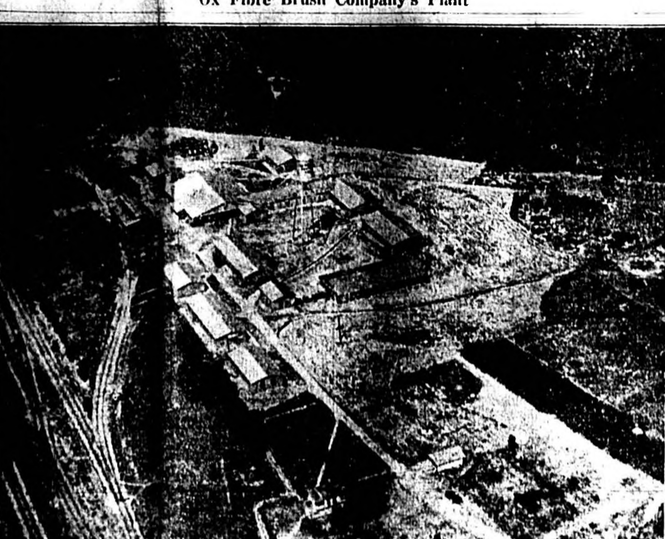
Here is an air view of the Ox Fibre Brush Co. Inc. plant located across the Monroe Bridge north of Sanford, where brushes by palmetto trees are transformed into brushes of all kinds. Neat and orderly, the plant was constructed by an expert.