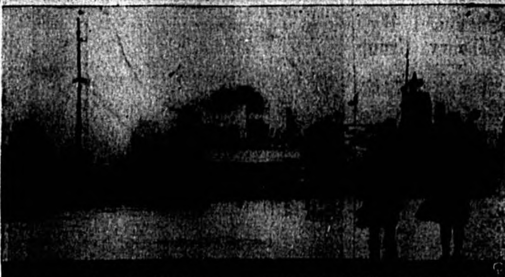
Waved on her way, the Red Cross mercy ship Savannah sails from New York for unoccupied France with a $1,240,000 cargo of medicine, milk and baby clothes. British blockade restrictions would not allow a shipment of cereals.

"I've referred to the United States Senator Wheeler, Democrat, Montana, last night called upon those who opposed passage of the British aid bill to give 'continued support in a crusade against war.' 'Continue the fight, not against the bill—now a law—but against war and against every step which gives dictatorial powers to the President,' he urged in an address prepared for an NBC broadcast.