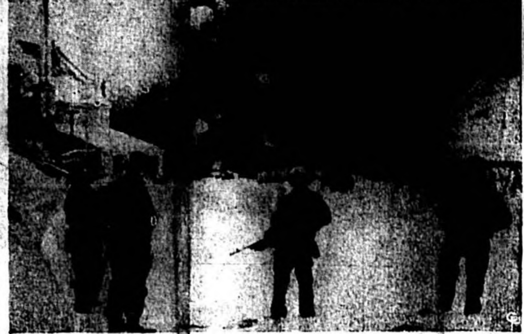
Guns ready, members of the British raiding party watch as fire sweeps the factory on the Lofoten Islands, off Norway. Principal objective was to destroy the codfish oil industry supplying the Germans with glycerine for their explosives.