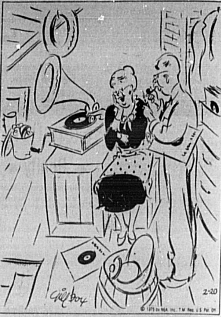
Listening to these nostalgic old songs makes you feel you could walk out in the moonlight without getting mugged!