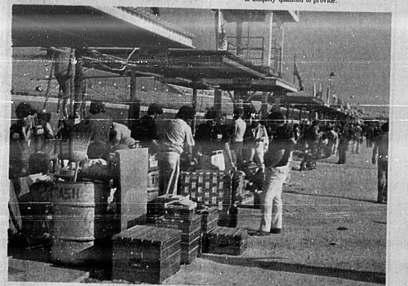
ACTION-PACKED DAY: 17th annual Daytona 500. In addition to being the richest stock car race in the world, also is Central Florida's No. 1 social event of the year.

Yesterday's high 75 low this morning 60. There was .88 of an inch of rain yesterday.