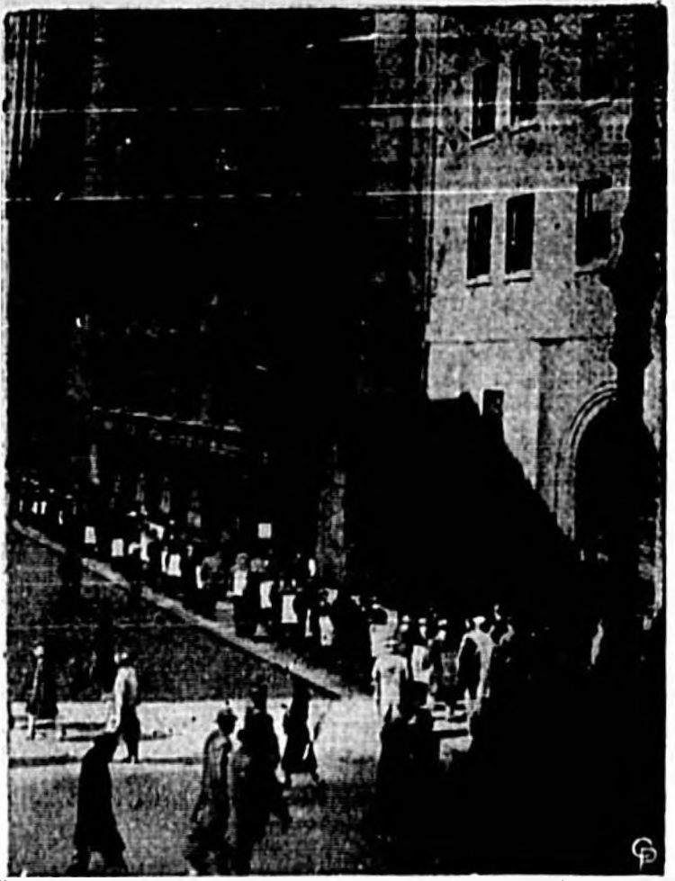
PHILADELPHIA, PA.—MEMBERS of the United Financial Employees (AFL) Union are shown as they paraded in front of the New York Stock Exchange...

(Continued from page one) The fourth delegate chosen was non-committal about his presidential preference.