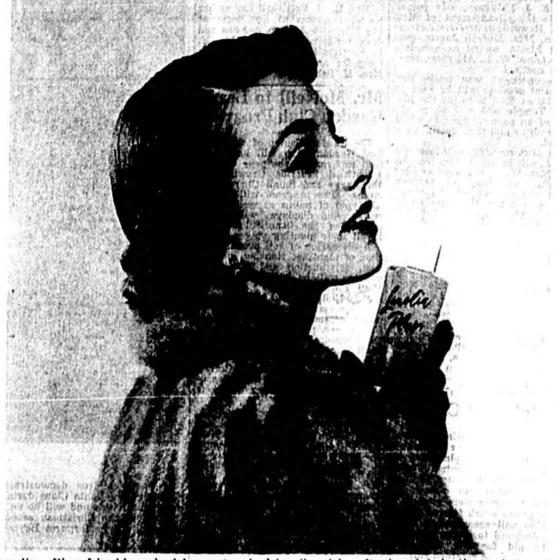
Lanolin Plus Liquid replenishes natural skin oils with softening, lubricating substances. It works effectively as cleansing cream or make-up base. Try it today; treat your face to a facial pick-up!

Ever hear this comment . . . "I can't use soap and water on my complexion because it's so dry?" What mildly often falls to realize is that the cream she's using for cleansing may actually be drying out her skin. Lanolin Plus Cleansing Cream For Dry Skin offers in cream form a cleansing agent delightful in texture due to its slick melting and deep penetrating oils. Why does Lanolin benefit your skin? Because Lanolin, a product obtained from the wool of lambs,