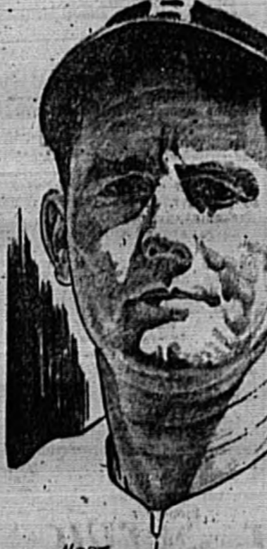
MORT COOPER WHOSE RETURN TO FORMER SEASON MAY BE AN OPEN THAT THE BOSTON BRAVES' BIG RIGHT-HANDER WILL BE BACK IN THE 20-GAME WINNER CLASS THIS YEAR!