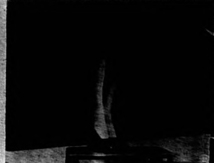
Single railroad tracks, which are not high enough to support a train, were used by the Germans to transport their heavy tanks. Photo, taken by the United States, shows the tracks being used for this purpose.