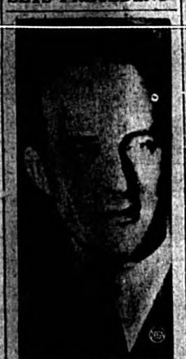
Spensard L. Holland, gubernatorial candidate, is shown in a portrait. He is a man with dark hair, wearing a suit and tie, looking slightly to the side.

The current incumbent of Le- opold III, King of the Belgians (above), "in full battle" was de- clared by Premier Reynaud of France to be a fact without precedent in history. Leopold's current government, especially the Belgians and Belgians in Paris and London, are now in a state of confusion.