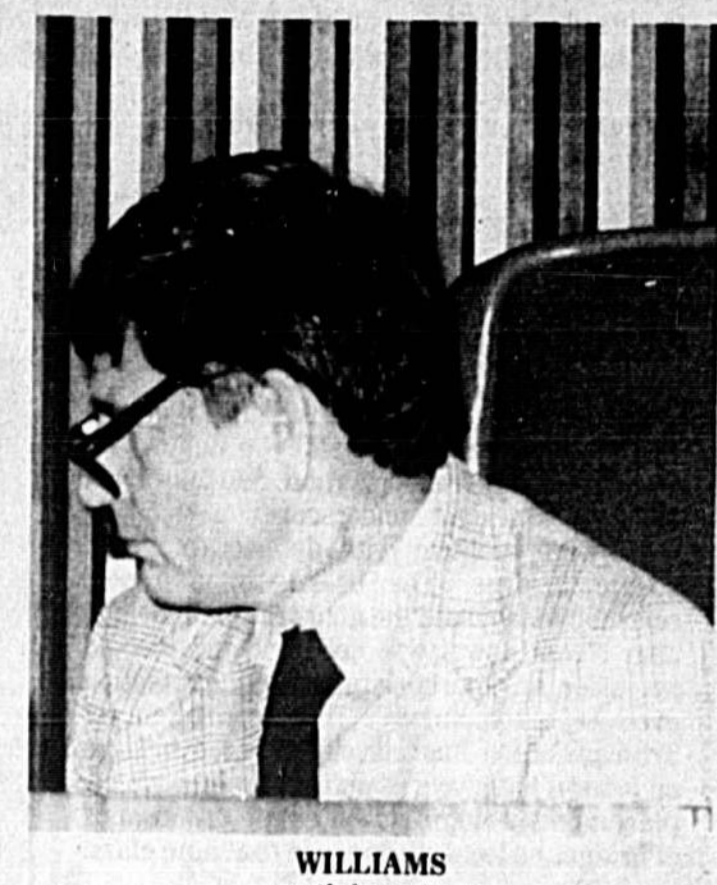
WILLIAMS scrutinizes the issues

After learning today that ridership has tripled on a bus route between Orlando and Seminole County, the Seminole County Commission indicated a preference for public transportation in the county by agreeing to subsidize the route, which is operating at a deficit.