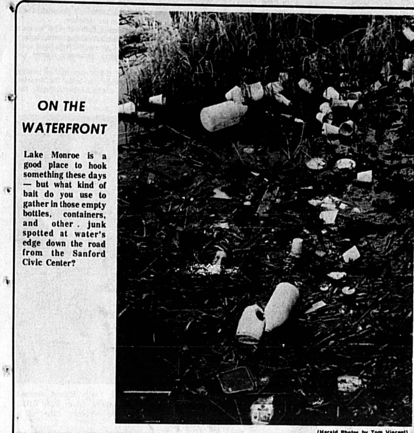
ON THE WATERFRONT Lake Monroe is a good place to hook something these days - but what kind of bait do you use to gather in those empty bottles, containers, and other junk spotted at water's edge down the road from the Sanford Civic Center?

69th Year, No. 152-Tuesday, February 15, 1977 Sanford, Florida 32771-Price 10 Cents