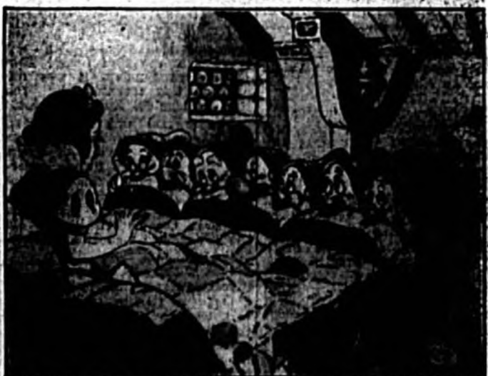
"SNOW WHITE AND THE SEVEN DWARFS" is returned to screen circulation, from which it was withdrawn at the peak of its popularity, as part of the Great Walt Disney Festival, a combination of Disney's finest production including the above mentioned full length feature, "Ferdinand the Bull, the Three Little Pigs in 'The Practical Pig,' 'The Ugly Duckling' and 'Donald's Lucky Day' all of which will be on the Ritz screen next Tuesday.