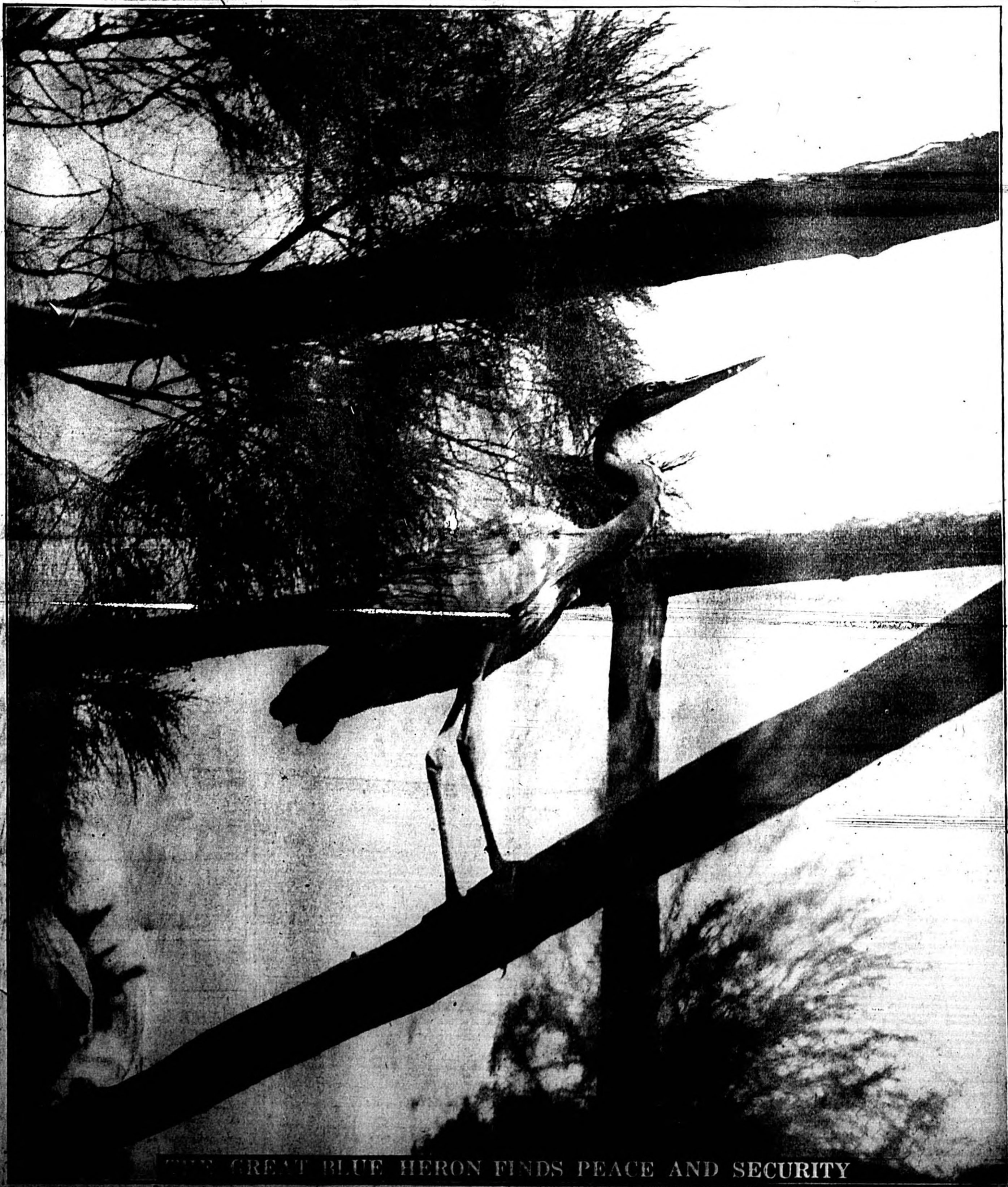
THE GREAT BLUE HERON FINDS PEACE AND SECURITY