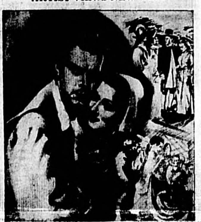
It's a story of love in old New England. Frank Lloyd directed.