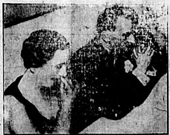
menths of sectuation following the abdication of King Britain because of his love for her. Mrs. Wallie ing publicly at social functions in Cannes. France. Bl at a dinner dance. Beside her is her dancing periods.