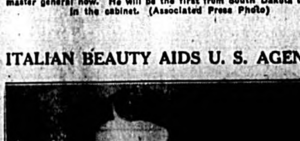
The latest photograph of John D. Rockefeller, taken just prior to his 77th birthday at his home, Bell House, Lakewood, N. J., is shown. He is a celebrated philanthropist and the richest man in the world.