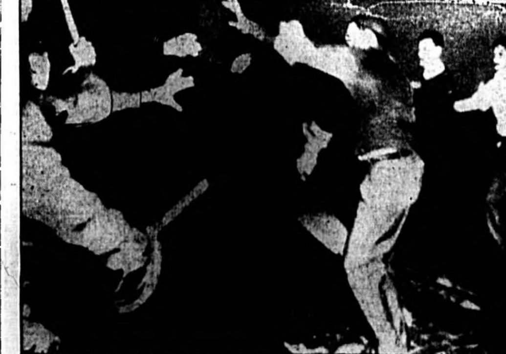
Here's a closeup of part of the action in Akron, O., when police used nightsticks and gas to batle a crowd of 4,000 pickets at the gates of the Goodyear Tire and Rubber Co., where a strike had been called two hours before. Sixty persons were sent to hospitals after the clash.