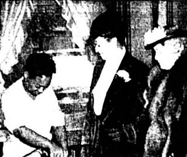
SERVANT PROBLEM being ironed out at Washington WPA household center where women received domestic training...