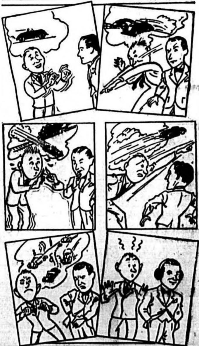
The speed demon who boasts of his driving exploits, to the intense disgust of his safe driving friends, is pilloried in The Trav-