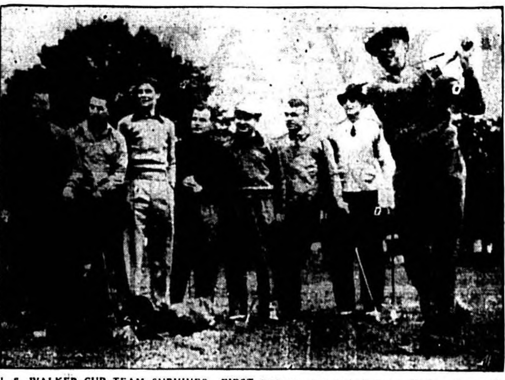
U. S. WALKER CUP TEAM SURVIVES FIRST ROUND—All United States Walker Cup golfers playing in the first round of the British Amateur Golf tournament at Troon, Scotland, survived that round, although they had to battle a fierce wind blowing over the course.

PALATKA NINE CONTINUES UPWARD CLIMB WITH 3-1 VICTORY AZALEA BOWL, PALATKA, May 27. The Palatka Azaleas continued their fighting drive to enter the first division last night when they captured a 3 to 1 decision over the Daytona Beach Islanders.