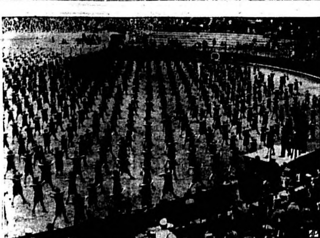
PRESENT—ARMS! has non-military significance for these Franco Youth being drilled for physical fitness by order of insurgent General Franco. "Gym" in Seville bull ring.