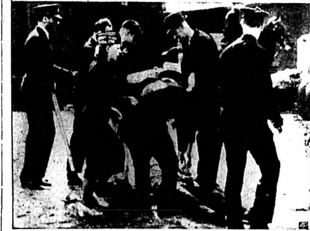
C. I. O.-affiliated pickets at the American Brass Co., in Detroit, May 28. Picket line in the picture at top just before the police charged them in what turned out to be a free-for-all fight between unionists, non-striking workers and police. When workers left the plant an organized and unionists met them in the streets, forced cars to the curb, and often pulled out and beat the non-striking occupants. The picture below shows an unidentified picket who was knocked unconscious in the fighting, about to be moved from the scene by his fellows.