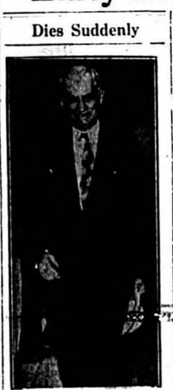
Joseph W. Byrns, Speaker of the House and wheelhorse of the Democratic party, who succumbed to a heart attack in the capital early today.

Byrns suffered a heart attack at 5:30 last night, a cerebral hemorrhage at 11, and died without regaining consciousness. Death of the Democratic pillar plunged the legislative situation into uncertainty.