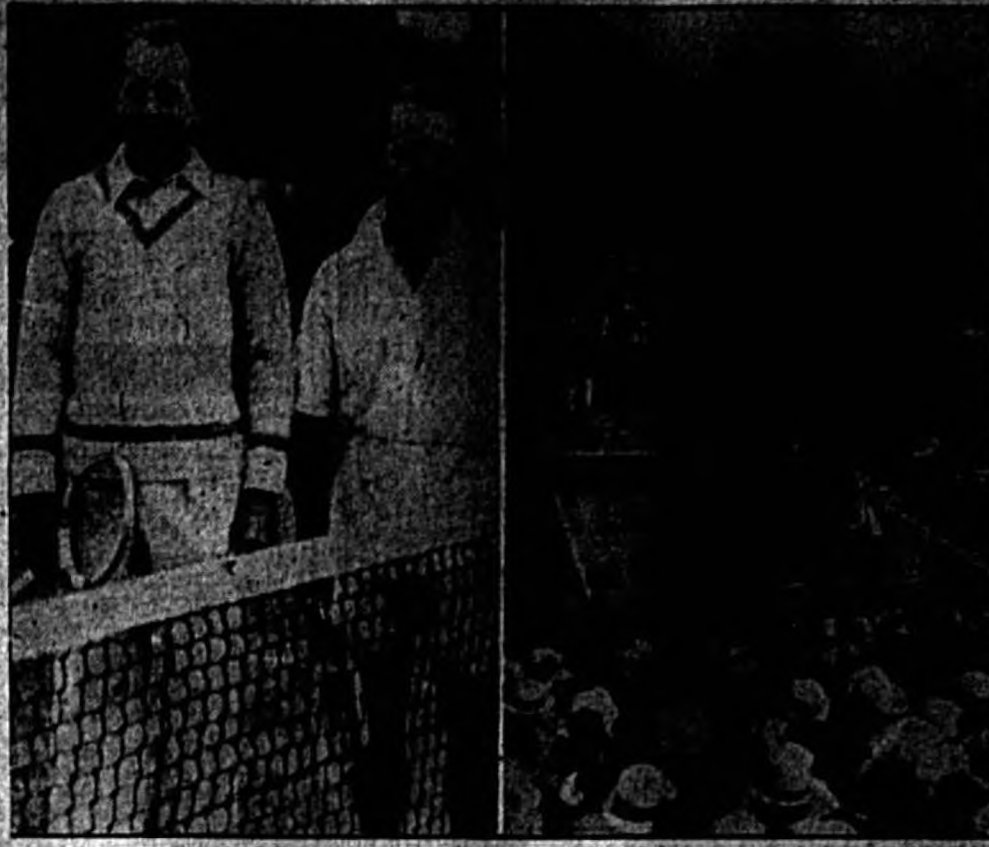
Donald Budge, America's only hope in Davis cup tennis play, is shown in the background of picture at the right during his singles match with Jack Crawford, the Australian, on the opening day of the American zone series at Philadelphia. Budge came through with a stirring five-set triumph to give the United States an even break against Australia. Adrian Quiet (left in picture at the left), the Australian, and Wilmer Allison of the United States team are shown before beginning their match which Quiet won.