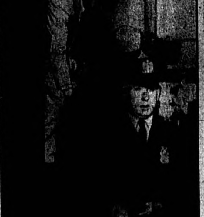
'Lucky' Luciano, reported vice overlord who is accustomed to limousines, rides to New York in an ordinary black maria. He is being escorted by police.