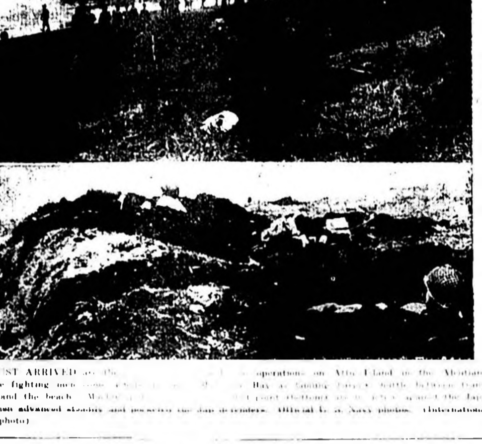
Operations on Attu Island in the Aleutians.

Recapture Of Kiska May Be Next Step In Drive Against Japs In The Pacific