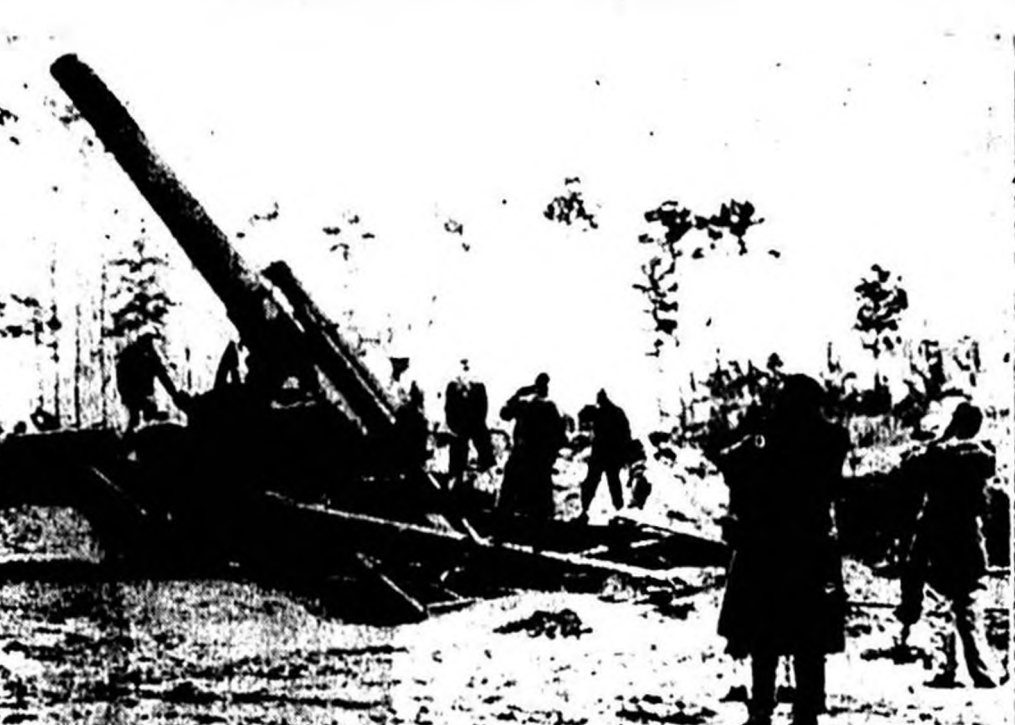
ARTILLERY OFFICERS PREPARE TO FIRE the new 210 mm. howitzer in a test firing at Ft. Belknap, Md. The tremendous gun, according to the Army Ordnance Department, is the most powerful and accurate that this country has ever produced.