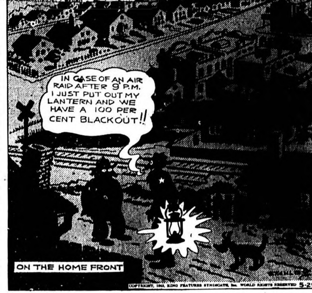
ON THE HOME FRONT