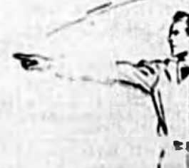
23. First Down

Take time out to visit COWAN'S for the latest in Fall styles. They carry a complete line of nationally advertised brands of clothing, millinery and shoes for the entire family.