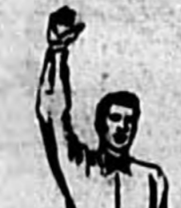
19. Ball Dead, If Hand is Moved from Side to Side, Touchback

You'll have less interference on your favorite programs if your radio is properly adjusted and repaired. Check with MAC'S ELECTRIC SERVICE for work expertly done.