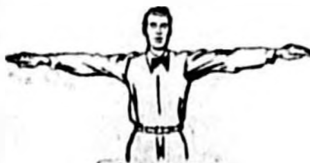
9. Unsportsmanlike Conduct

There are no kicks from the housewife when she buys all her bakery goods from ROBIE'S HOME BAKERY . Orders taken for special occasions.