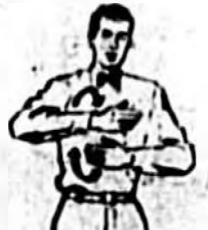
2. Illegal Position or Procedure

You're never offside when you buy your office supplies from POWELL'S OFFICE SUPPLY CO. where you'll receive courteous and efficient service.