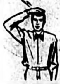
15. Ineligible Receiver Down Field on Pass

There's no interference with good health when you stock up on drug necessities. Get them at LANEY'S and you get them at the lowest cost.