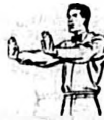
14. Forward Pass or Kick Catching Interference

Pass the ball to SANFORD ELECTRIC COMPANY when you need electrical supplies. Check with SANFORD ELECTRIC CO. for household appliances too. Headquarters for G. E.