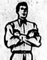
4. Delay of Game

Shift your savings to the FIRST FEDERAL SAVINGS & LOAN ASSOCIATION for better living is thru savings. They have a thrift account for everyone in the family. Member of Federal Savings and Loan Insurance Corporation.