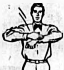
11. Illegal Use of Hands and Arms

Talk about holding . . . KADER JEWELRY will hold anything in stock on a small deposit. Their plan is going to make Christmas shopping a lot easier this year. Wide selection of nationally advertised goods.