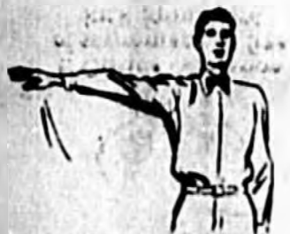
5. Personal Foul (Tripping, hurling, tackling out of bounds)

For relaxation at its best visit the RITZ THEATRE , fully air-conditioned for your comfort. Showing the best feature attractions, with tasty hot popcorn and a complete line of candies always on sale for your convenience.