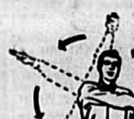
24. Start the Clock or No More Time-Outs Allowed

First down to the WILSON-MAIER FURNITURE CO. gets first choice on their outstanding collection of fine furniture. Newest Styles, sturdiest workmanship. Stop in today for furniture with that "Florida atmosphere".