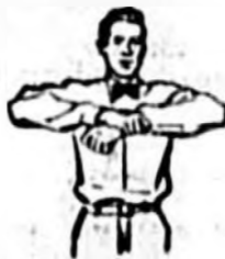
10. Defensive Holding

There's nothing unsportsmanlike about the friendly and efficient service you receive at the FLORIDA STATE BANK . Be safe, your savings are insured up to $10,000 at the FLORIDA STATE BANK .