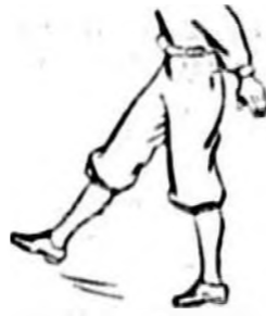
8. Roughing the Kicker

There's no clipping at McCRORY'S . . . . For ready reference to bargains, visit McCRORY'S often for many household items . . . also clothing, cosmetics, toys.