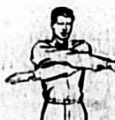
17. Incomplete Forward Pass, Partially Declined, No Play or No Score

Put the touch on Santa now for that new Bendix or Maytag Washing Machine and a beautiful Crosley Refrigerator or other appliances. He can get them at RANDALL ELECTRIC COMPANY .