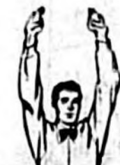
20. Touchdown or Field Goal

For the best in tasty short orders and sandwiches visit ANGELS EAT SHACK after the game. Serving your favorite beverage to make the meal complete. We remain open until midnight and offer curb service for your convenience.