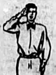
6. Roughness and Plugging

There's nothing fout about the household furnishings at MATHER OF SANFORD . For the best in furniture bargains shop the home of Good and Bad. MATHER OF SANFORD .