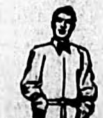
18. Crawling, Helping the Runner or Interlocked Interference

There's nothing incomplete about the service rendered by JIMMIE'S GULF SERVICE STATION . Complete service for your car is the basis on which they've built a service famous the county over.