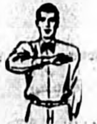
3. Illegal Motion or Shift

GENE'S TEXACO SERVICE at 1120 Sanford Ave. is in the right position and use the right procedure to render the best of service to its patrons. Stop in today and fill up with Texaco.