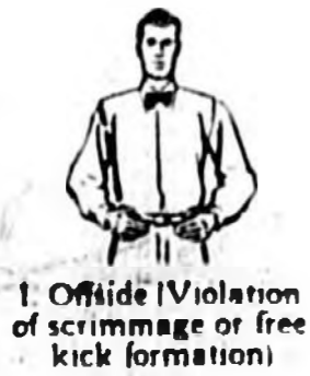
1. Offside (Violation of scrimmage or free kick formation)

You're never offside when you buy your office supplies from POWELL'S OFFICE SUPPLY CO. where you'll receive courteous and efficient service.