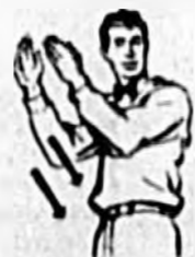
12. Intentional Grounding

Try using your hands to count the money you'll save by making WESTERN AUTO STORES your headquarters for automotive and home needs.