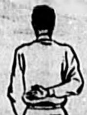
13. Illegally Passing or Handing Ball Forward

Intentional and always expertly done at LANEY DRY CLEANERS . They get your duds spic and span, press them up just right—and in jig time. They offer rapid pick-up and delivery service, too.