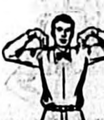
16. Ball Illegally Touched, Kicked or Batted

No one's ineligible for top flight cleaning service when they turn to SEMOLE DRY CLEANERS . For fast and courteous delivery service call 861.