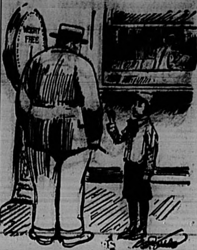
"If you get your work done, don't get paid, you might as well be dead."

lative market existing in one or two cases formed no basis for a fair valuation. In the Allegheny case much has been made at this hearing of the "when issued" market, which sprang up after we had fixed the price at which we would sell the stock, but about the time a few of the offers were made. As a matter of fact, at the same time 500,000 shares of the stock were offered publicly at $21 a share, a far better indication of the market value of the stock than the narrow and speculative "when issued" market.