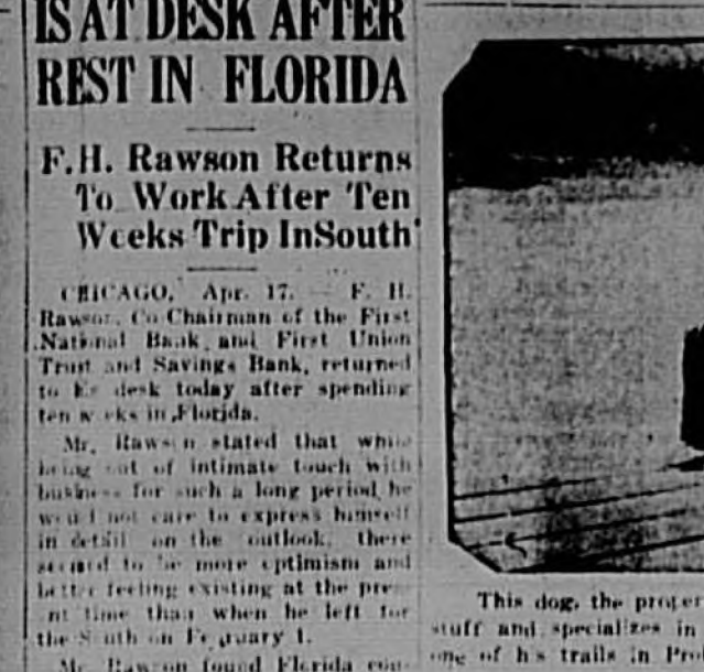
This dog, the property of United States agents, really knows its stuff and specializes in pocket flask and is shown at the end of one of its trails in Prohibition work.