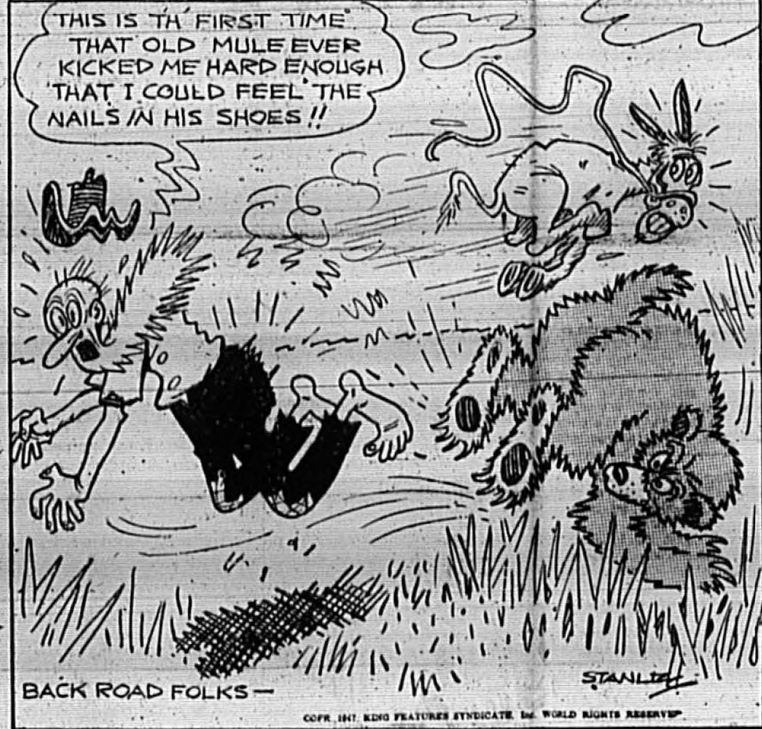
BACK ROAD FOLKS—