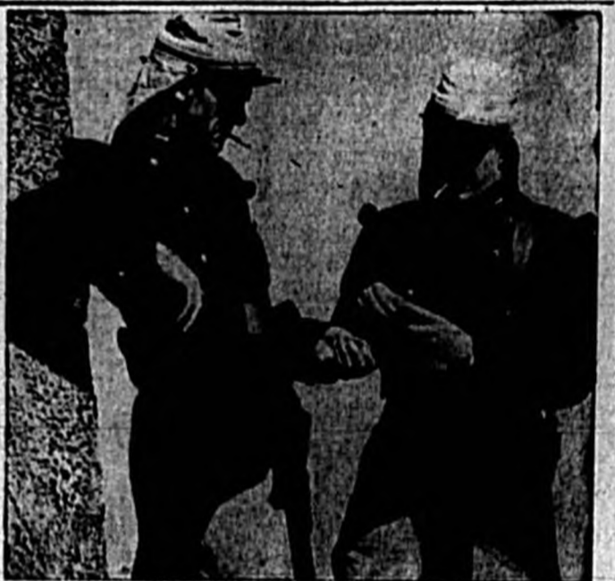
GARY COOPER and Ray Milland take down for a few puffs while on location for "Beau Geste," one of the first of the new season's big pictures, which will be the attraction Sunday and Monday at the Ritz Theatre.