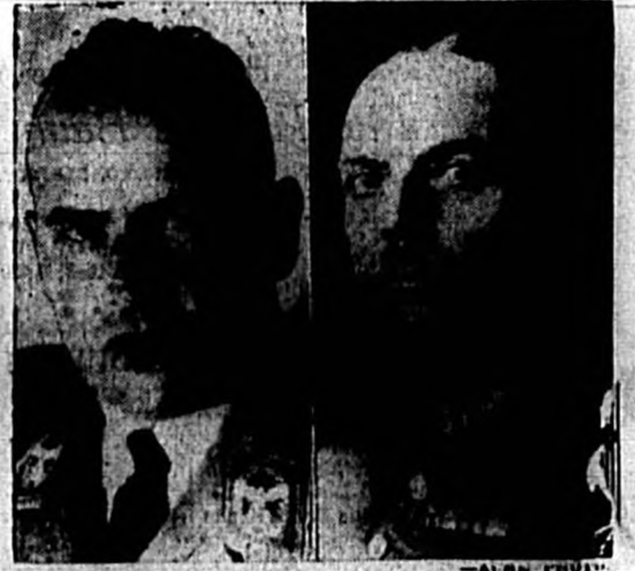
ADOLPH HITLER appointed Col. Gen. Gerd von Rundstedt, right, Chief of Military Administration in German occupied Polish territories. Reichminister Hans Frank, left, was appointed administrative chief of the territories.