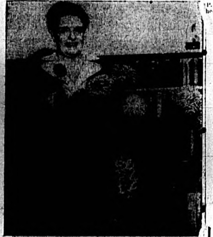
Mary Margaret McBride, author, receives the first bouquet of the new David Burpee Zinnia, which was shown recently before 2,000 flower specialists and horticulturists at a preview at the Waldorf-Astoria Hotel in New York City. The flower, a granddaughter of the famous "Old Maid" of early American days, is five to six inches across and up to four inches deep. It will bloom in any garden within 10 weeks from seed. Note the difference in size of the new giant Zinnia and the old variety being held by Miss McBride.