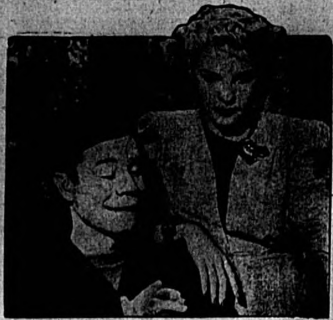
JOE E. BROWN and Marjorie Reynolds are in somewhat of a pensive mood in this scene from Paramount's $1,000,000 "A TOUCHDOWN," first feature comedy of the season, which will be shown Friday and Saturday at the local Ritz.

Wellman was chosen by Paramount to bring "Beau Geste" to the screen again because he has clearly demonstrated with more than one notable picture that he can bring sweeping action to the screen in an unimpeachable and thrilling style. Early in his career he made "Wings," an aviation epic which proved all aviation pictures made on the screen until Wellman, himself, produced and directed the recent Technicolor epic of the air, "Men With Wings." Moreover, he also proved with "A Night in Bern" and "Nothing Sacred."