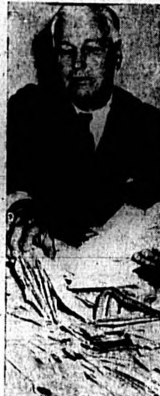
Mail bombardment on Washington continues as public participation in arms embargo fight. Reportedly, 90 per cent of these letters, received by Senator Guy Gillette of Iowa, isolationist, are anti-repeal.