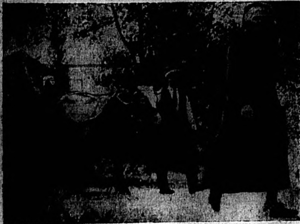
War terror and tragedy comes to the western front. Fleeing battle's advance, French peasants close behind the Maginot line hitch the family cows to a wagon, bundle up the children, leave home in search for a safe spot. Picture was passed by censor, flown to the United States by Clipper plane.