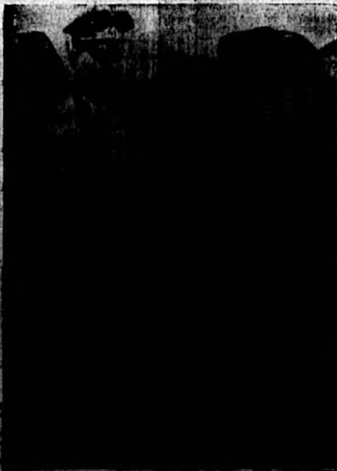
GERMAN FOREIGN MINISTER Ribbentrop, seen here, is expected to report for Moscow. This is Ribbentrop's second trip to Moscow.