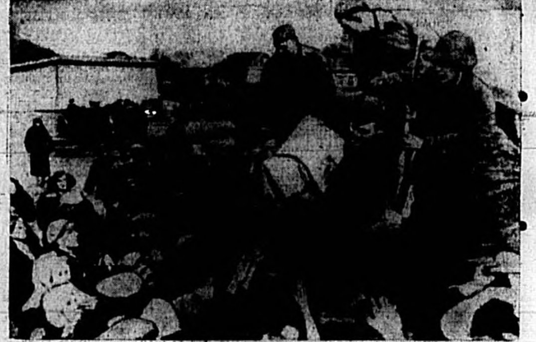
PROPAGANDA FOLLOWS Russian arms; Soviet troops are shown distributing propaganda sheets to Polish peasants near Vilno, Poland.