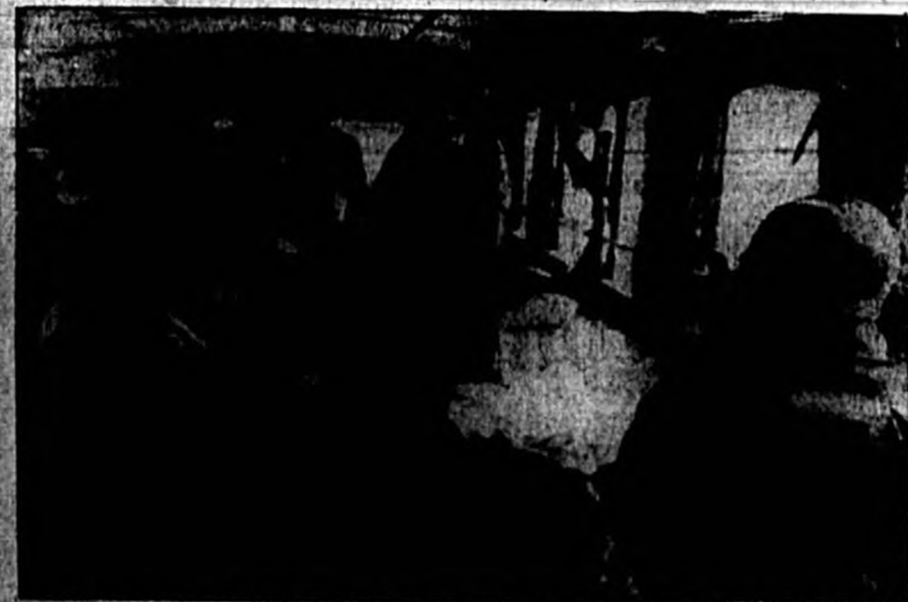
REMINISCENT OF the signing of the World War armistice in 1918 is this radiotelephoto from Berlin to New York, as Polish representatives, with backs to camera, negotiate terms for surrender of Warsaw with Gen. von Blaskowitz, German commander, left, and other officers in railroad car.