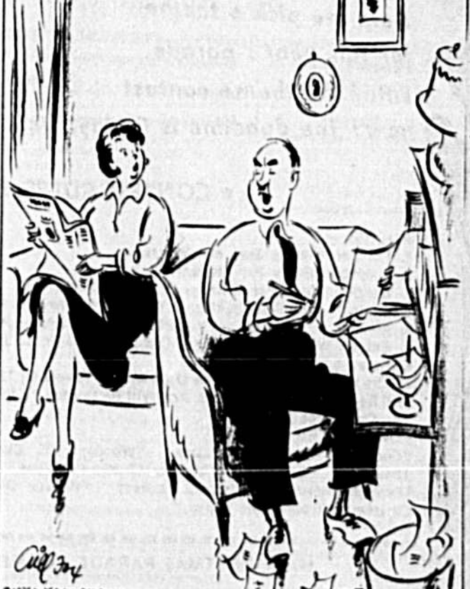
Edit, I've decided to combat inflation with a divorce!