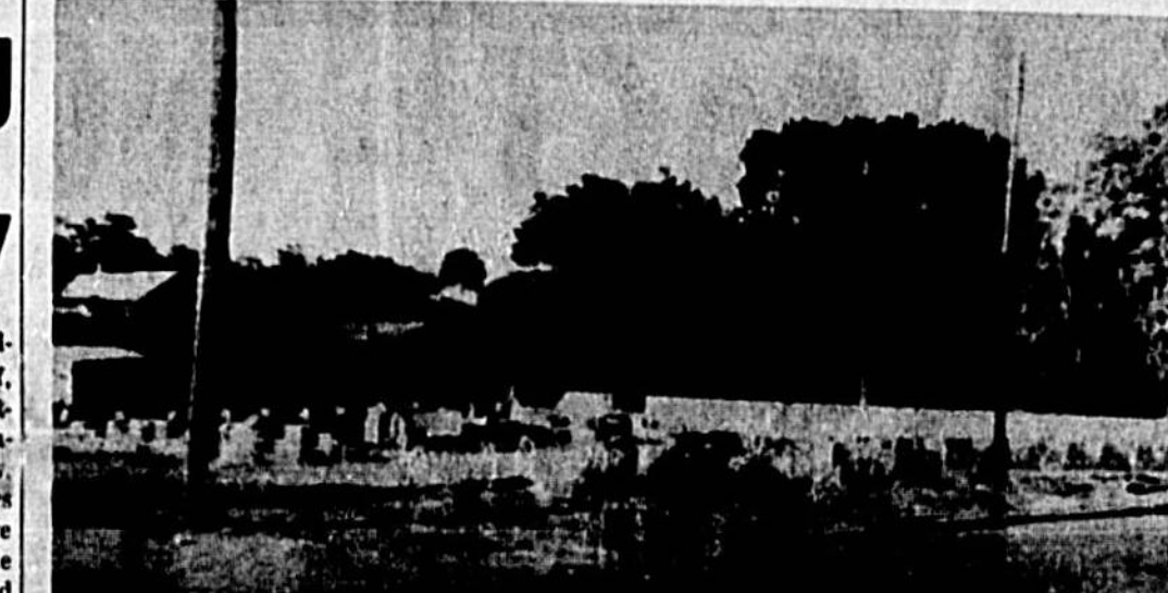
CONSTRUCTION has started on a Park and Shop Supermarket at Fourth and Cypress. This is in the rear of the existing Tip Top market at Fourth and Sanford Avenue. The Tip Top building will be torn down, and in its place, paved parking. Remodeling has also begun on the Tip Top on 13th Street in Goldsbrough, which also will be renamed Park and Shop. These markets are owned by Gazil, Inc.