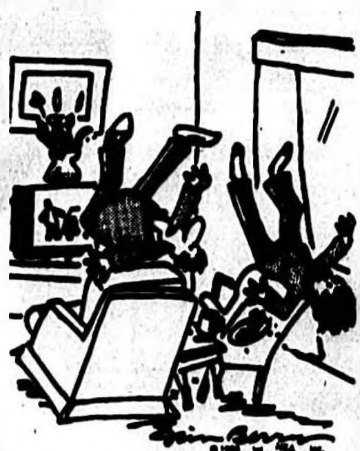
"Now THAT commercial is definitely louder than the regular programming!"