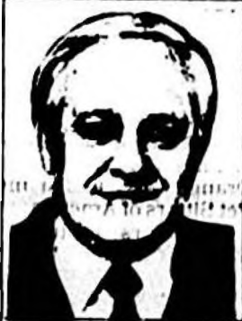
As in, drugs are a cancer eating away at America's families.

According to the Justice report, Operations Motorcross and Broken Border were soon initiated. It began with a Justice agent posing as a crooked immigration inspector. Soon he was given a $32,400 bribe to hand over immigration documents and look the other way as cocaine was smuggled across the border. The DEA allowed the "controlled" deliveries of cocaine to the drug traffickers.