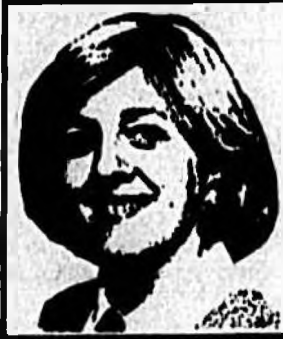
Suburban, married moms with kids at home were never more than 6 percent of the voters.

It was women as whole, women of all ages and athletic pursuits, who lived up to their political notices. If the exit polls prove to be right, this is the first time in American history that men alone would have elected a different candidate than women alone. Men