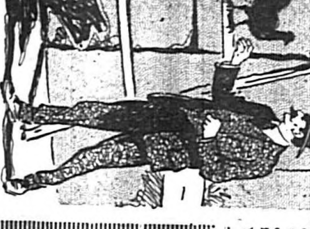
Leased the Loan Check in the Post...