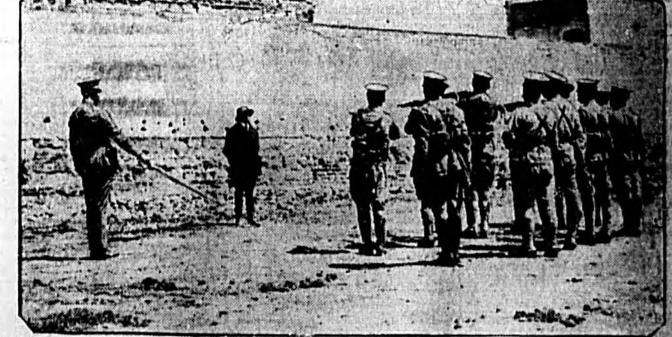
The remarkable picture above shows General Alfredo Quijano, Mexican rebel general, as he faced a firing squad of federal troops near Mexico City following the failure of the recent revolution. General Quijano waved farewell to a little crowd of newspaper men and women, and once bade the soldiers come closer that they might aim better.