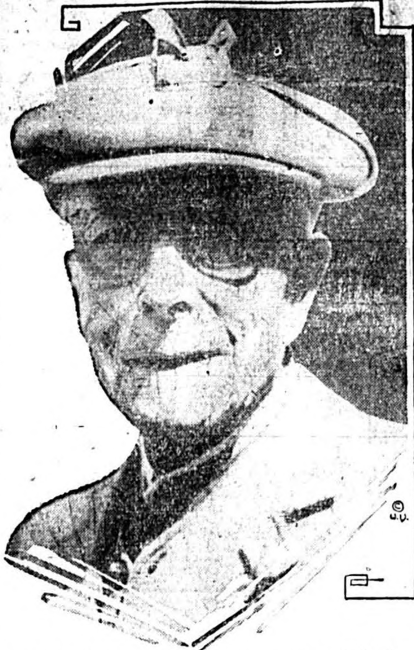
John D. Rockefeller recently for the first time permitted his picture to be taken as he played golf on his private course in Westchester county, New York. This likeness was the result of a photographer's hours of tireless effort. The financier, who is 88, soon will be leaving Pocantico Hills for his winter home at Ormond, Fla.