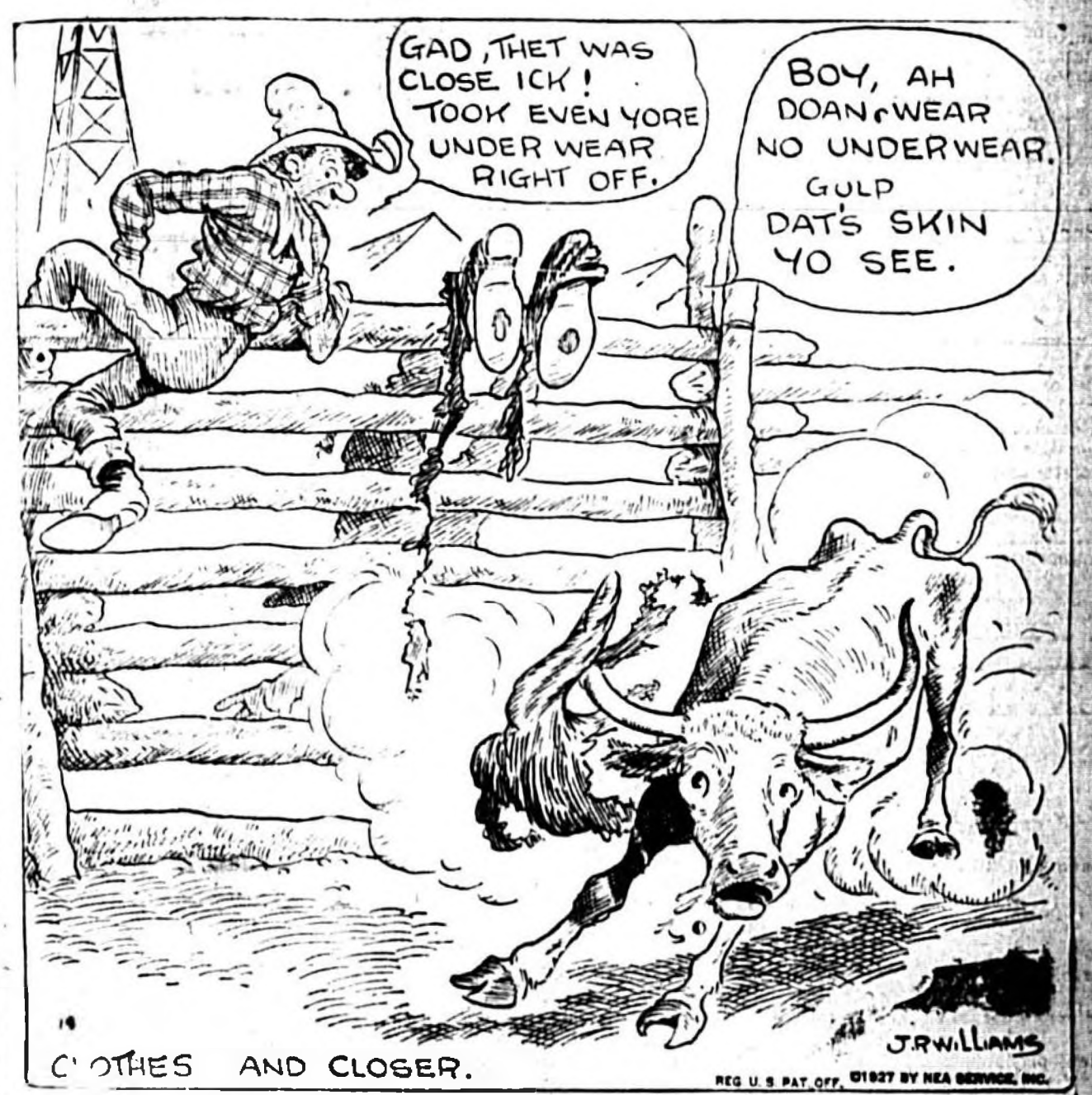
CLOTHES AND CLOSER.