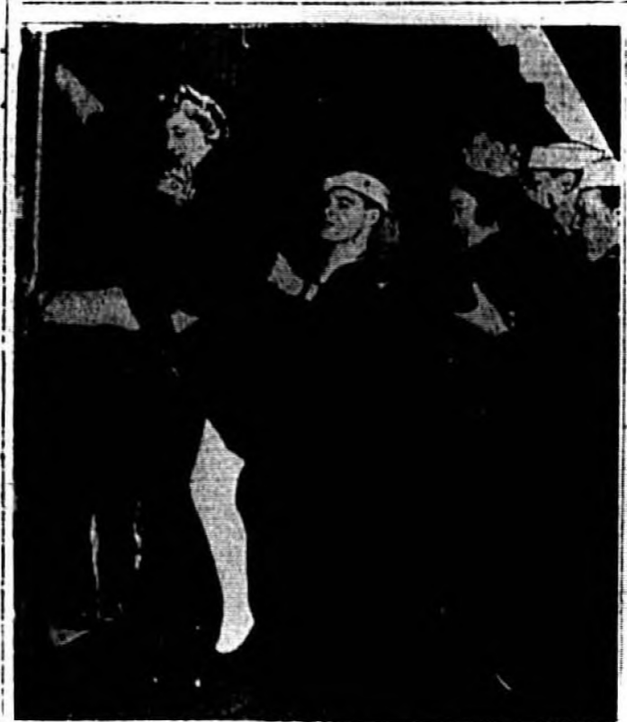
Plenty of Hollywood gentlemen as well as fighters, these Hollywood Victory Caravan members are seen here in a group photo.