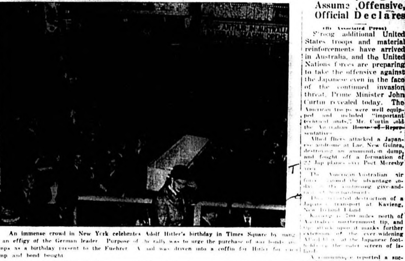
An immense crowd in New York celebrates Adolf Hitler's birthday in Times Square by burning an effigy of the German leader.