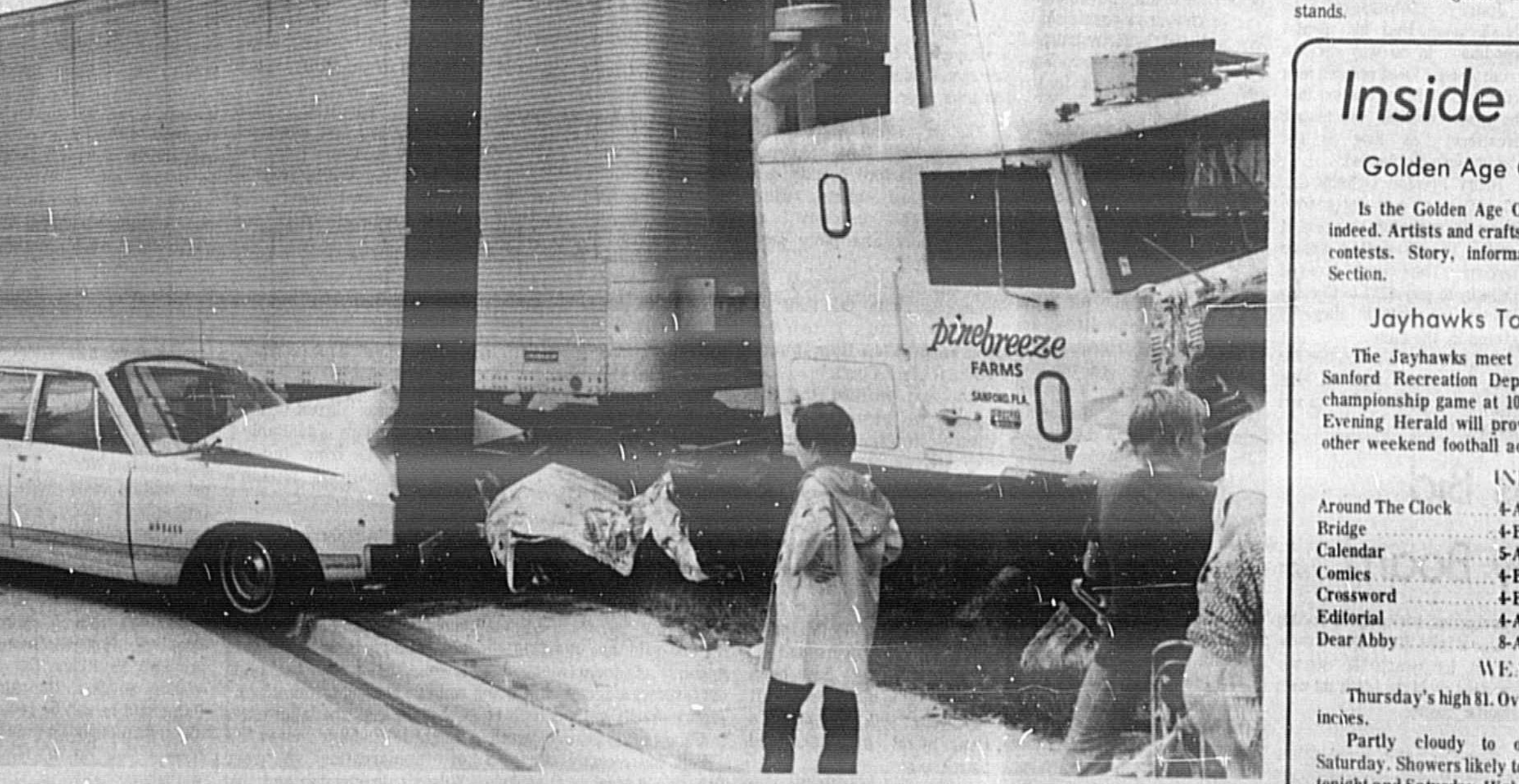
TRAFFIC CRASH INJURES FIVE

from each $2 ticket to be applied to the outstanding balance of the high school stadium loan. In succeeding years the 25 cents on each admission will go to the host school. All other proceeds will be split equally among the bands. Large trophies donated by the Evening Herald will be presented to participating bands by Herald Editor