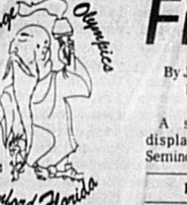
Golden Age Olympics.