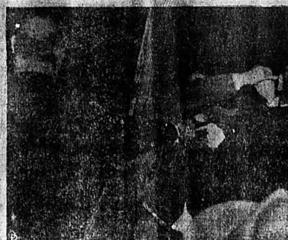
Fists flew briefly in the governor's office as the Georgia State Capitol in Atlanta, when supporters of Herman Talmadge and supporters of Gov. Arnall disagreed as to who was Georgia's Chief Executive. Talmadge was elected as Governor during the 13-hour session of the joint House and Senate, but Gov. Arnall refused to recognize Talmadge as the new Chief Executive, and accepted Talmadge as being a "pretender."