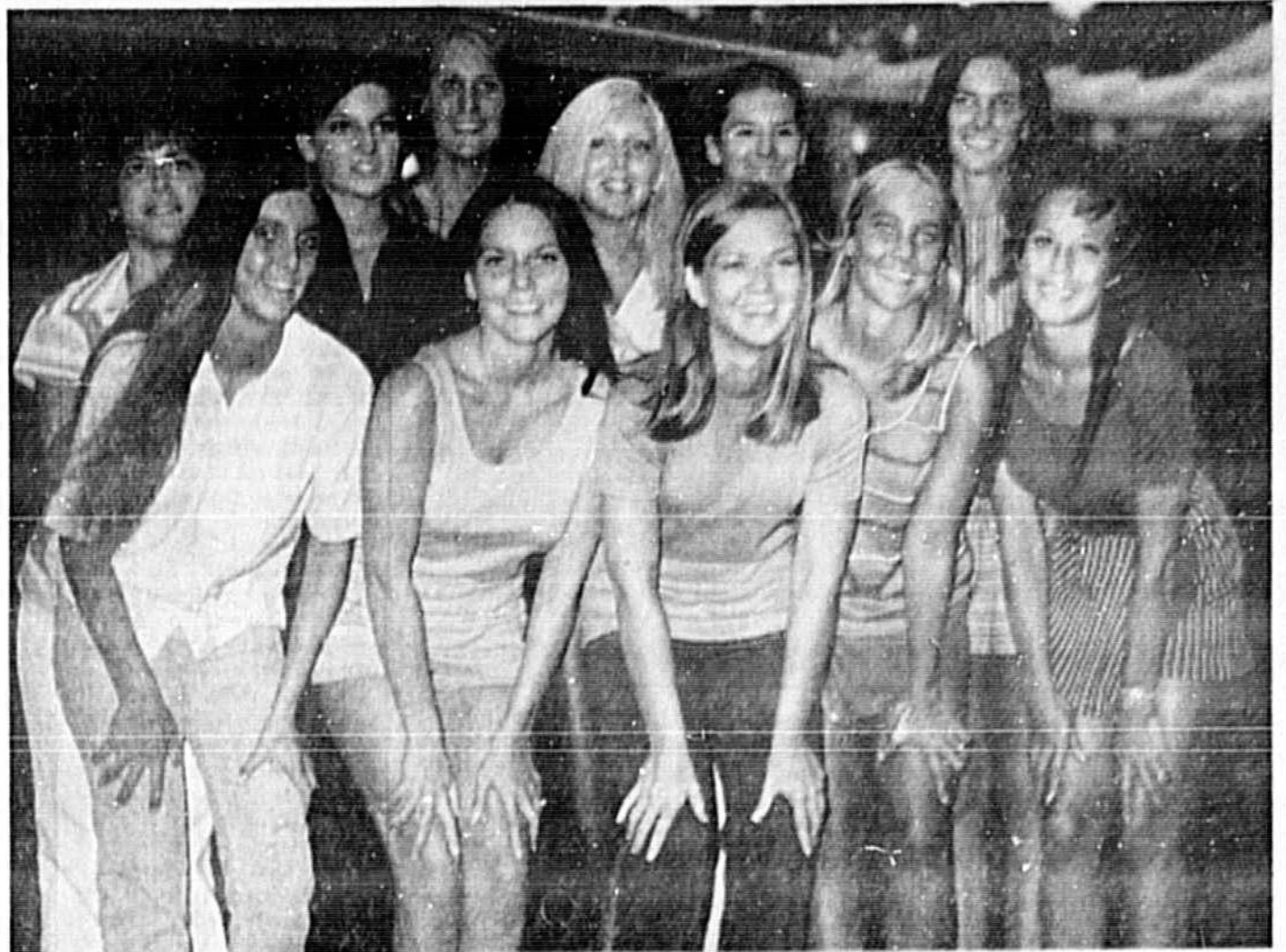
WHICH ONE WILL BE CROWNED MISS MAITLAND?

Most of Mrs. Binh's seven points were Communist proposals repeatedly rejected by the United States and the South Vietnamese government. They included the removal of President Nguyen Van Thieu and Vice President Nguyen Cao Ky and a permanent ban on all American military aid to South Vietnam.