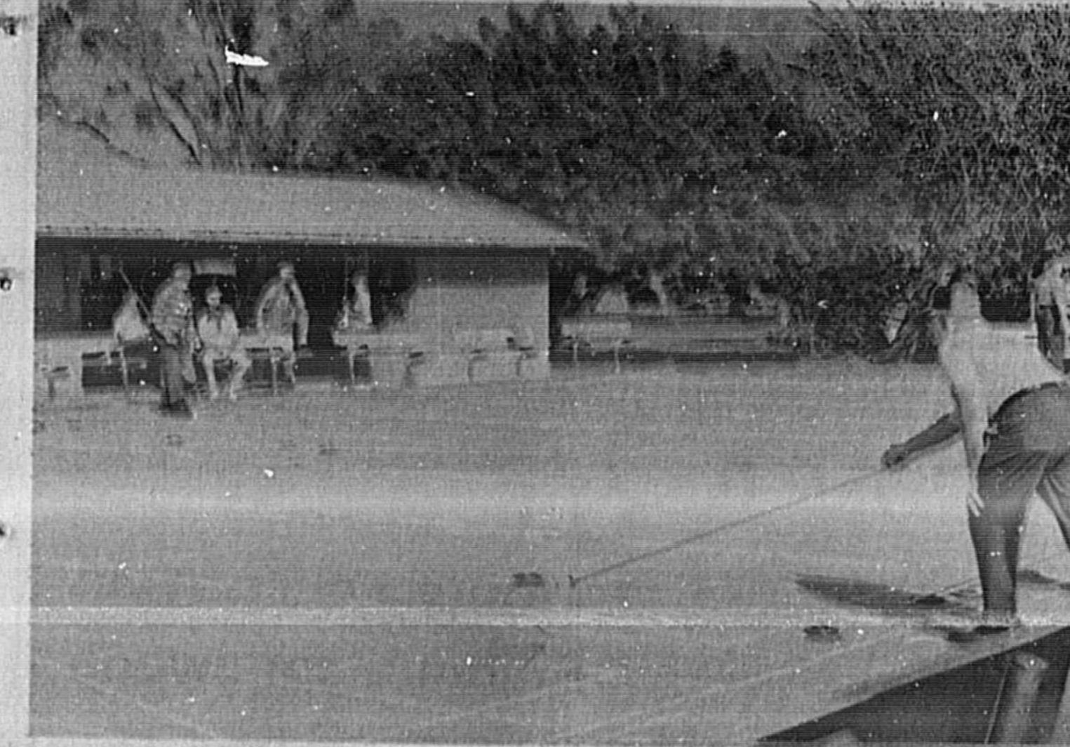
Players at the Ft. Mellon Park shuffleboard courts have made the most of a mild winter, enjoying daily exercise in the sunshine... until today's cold snap drove all but the most hardy individuals indoors to wait for more warm weather. The temperature dropped to 49 this morning.