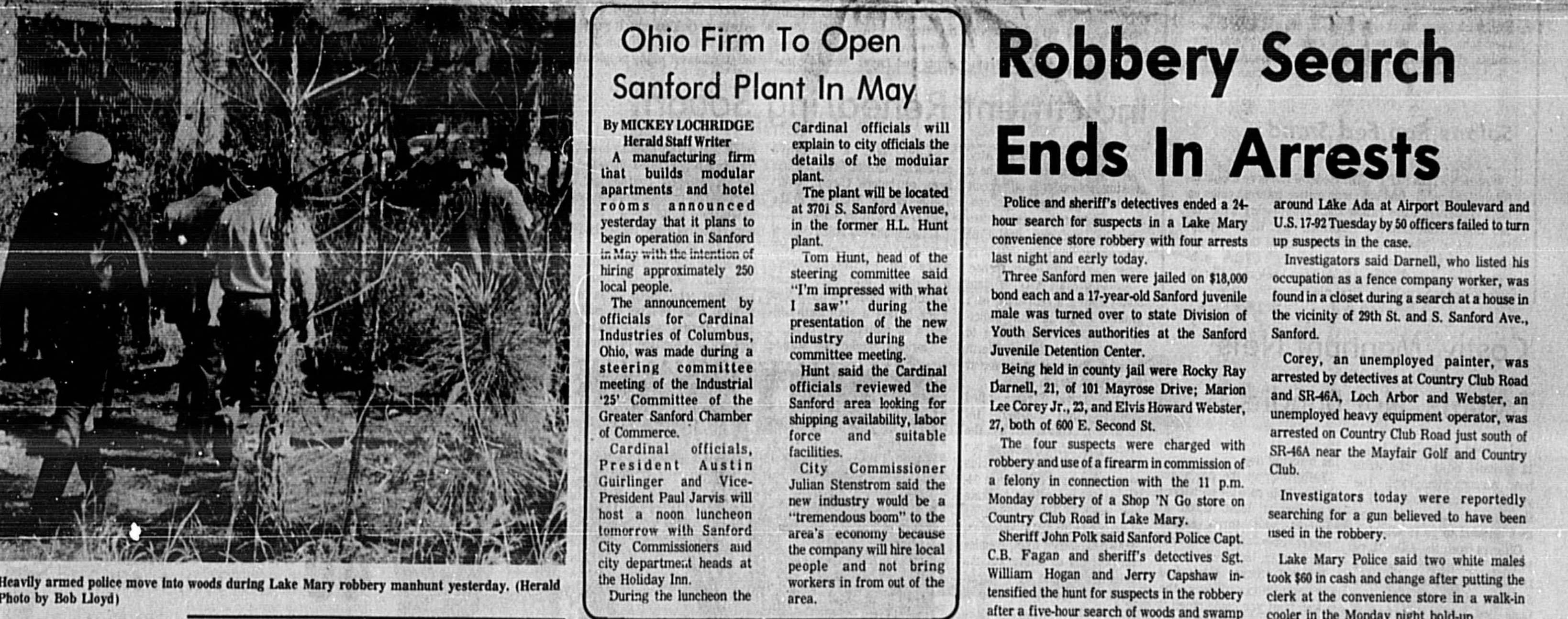
Heavily armed police move into woods during Lake Mary robbery manhunt yesterday.

By BOB LLOYD Herald Staff Writer A five-hour manhunt at Sanford yesterday didn't turn up two robbery suspects but did flush two truants from a walled school in a wooded area off Airport Boulevard.