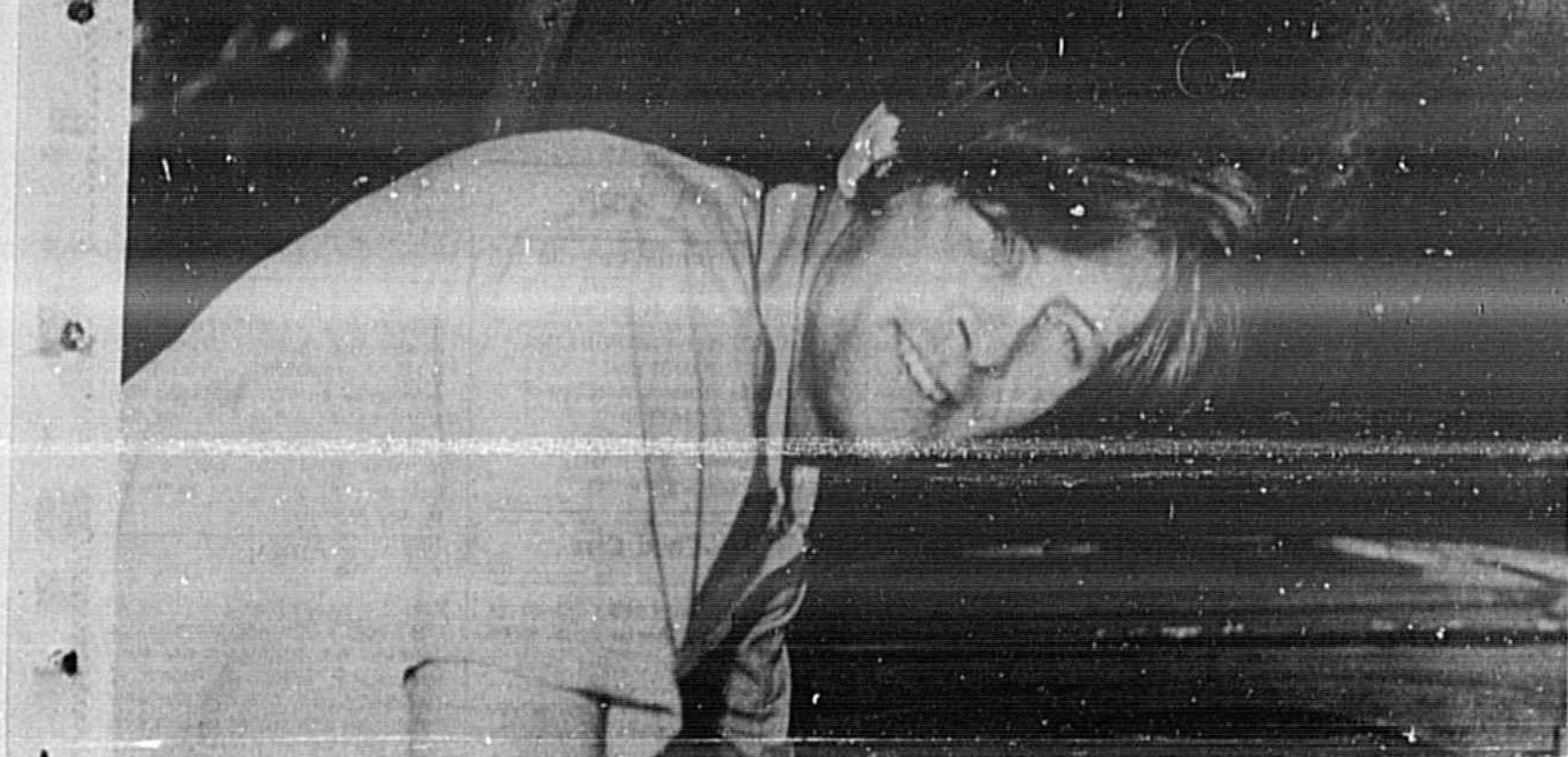
Lewis Automotive helps you whip inflation now.