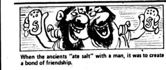
When the ancients "ate salt" with a man, it was to create a bond of friendship.