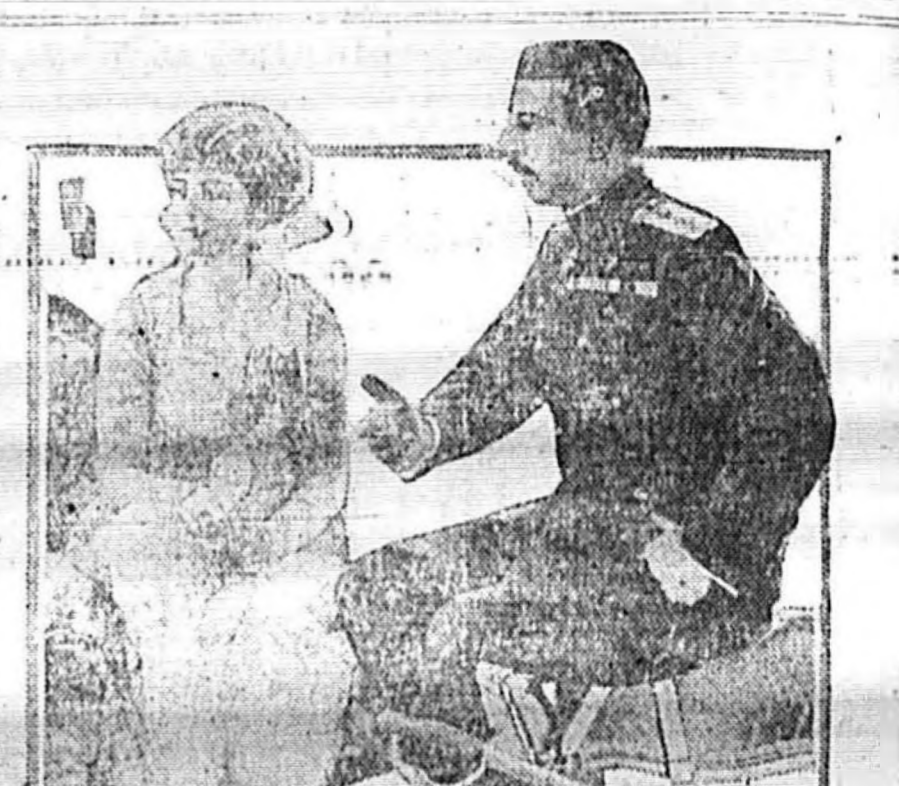
A Scene From THE PRISONER OF ZENDA At the Princess Tonight and Saturday—Matinee Daily