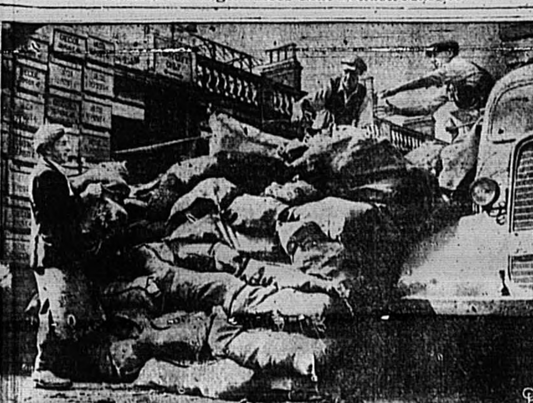
TONS OF VEGETABLES AND FRUITS ARE CARTED from the Covent Garden Markets, London, largest in Britain, to the country for dumping and plowing under because of a glutted market. Wholesalers charge that retailers refuse to buy large quantities because they want to maintain "scarcity" prices for their customers. The retailers say that the wholesalers prefer to waste the produce rather than sell at low prices. Market workers are shown above piling up bags of cabbage at Covent Garden for shipment to the dumping grounds. AEA last report. (The cabbage was offered for sale at two shillings a sack.)