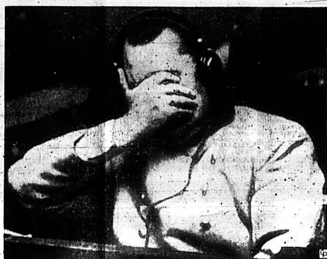
Half militarist, half gangster Hermann Goering, former number two Nazi who had been termed by U. S. Prosecutor Jackson as "hall militarist and half gangster," virtually conceded that he is on the way to the gallows. Perhaps remembering when he strutted through Germany as a member of the highest Nazi inner circle, Reichsmarschal Goering covers his eyes with a pudgy hand during the trial.