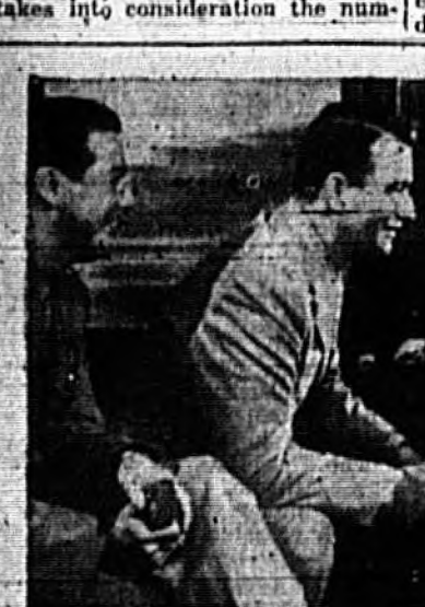
The beginning of a beautiful friendship... Without Reservations...

NASHVILLE, Tenn., Sept. 27. (AP)—The time schedule for the McCormack meat plan was upset today by a city ordinance.