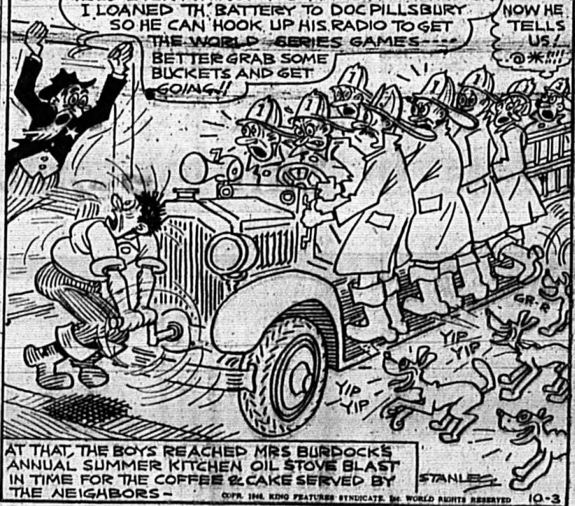
AT THAT THE BOYS REACHED MRS BURDOCK'S ANNUAL SUMMER KITCHEN OIL STOVE BLAST...