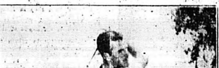
Photo by Raymond Studio. Photo by Raymond Studio. Photo by Raymond Studio.