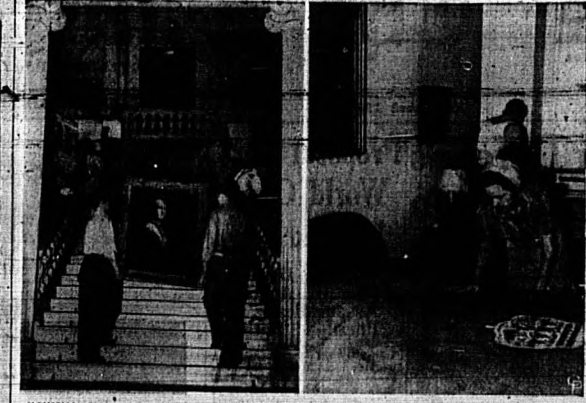
HOUSEMAIDS AND SERVANTS work feverishly to get the royal palace in Athens epic and span for the return of King George...