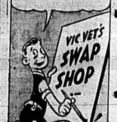
For general information contact your nearest VETERANS ADMINISTRATION office.

MAYBE YOU CAN GET A GI LOAN TO START A BUSINESS... BUT BE SURE IT'S SAFE OR YOU'LL BE SORRY.