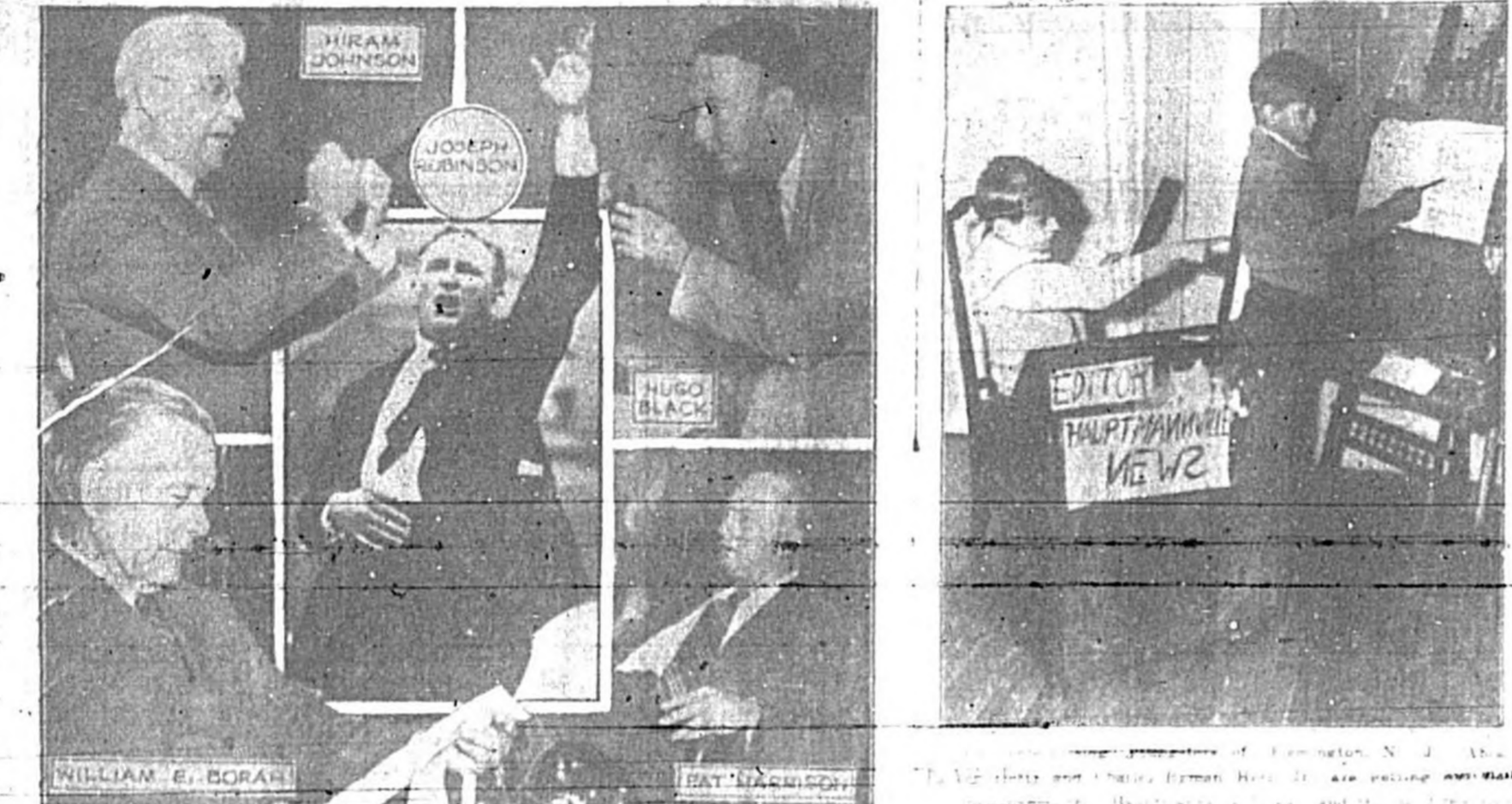
Senators in the courtroom during the trial of Wuxtra. The trial is expected to last several weeks.