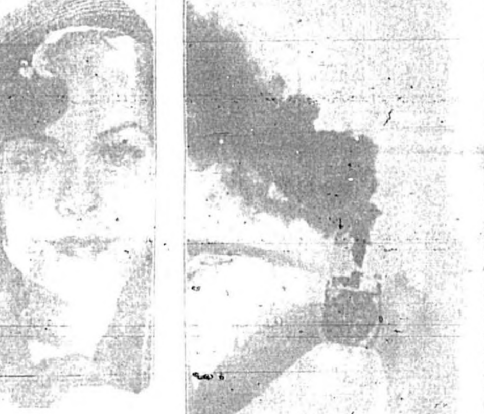
A woman is the target for Cupid at a social gathering. The event was a success and everyone had a good time.