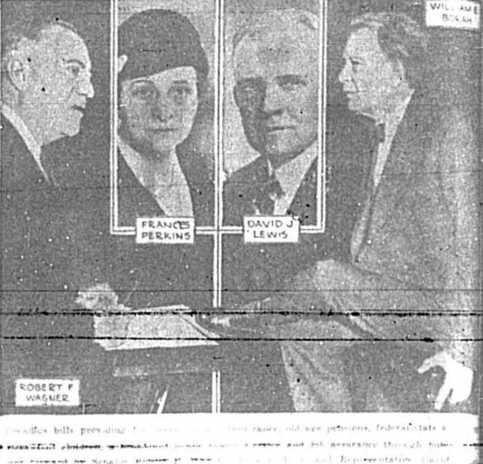
Government officials discussing the economic security program. The program aims to stabilize the economy during these difficult times.