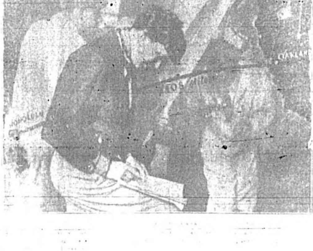
Amelia Earhart conquers the Pacific in a daring flight. Her journey is a testament to human courage and endurance.