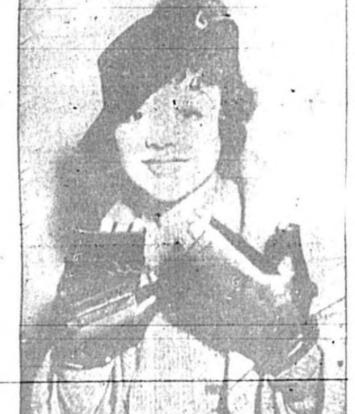
Amelia Earhart, preparing for a daring flight. She is one of the few women who have crossed the Atlantic Ocean.