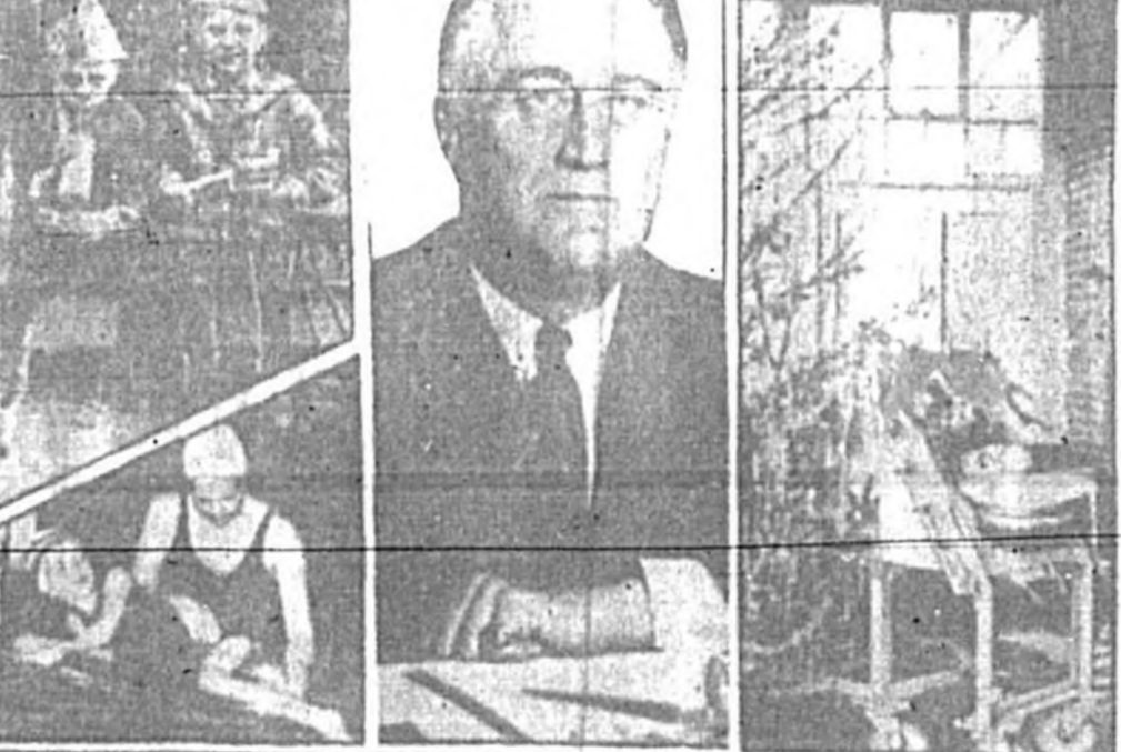
A man speaks at a public event, receiving a unanimous 'no' vote. The event was a success and the man was well-received.