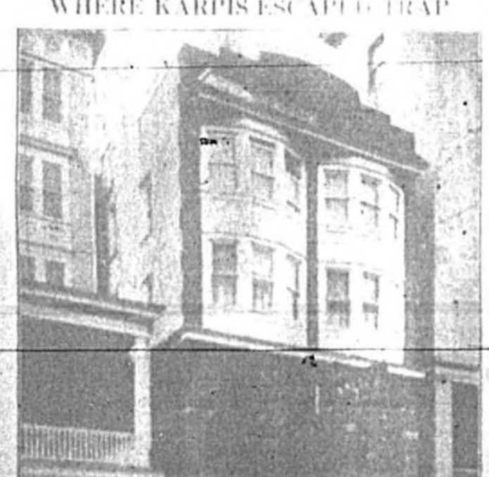
The Danmore Hotel in Atlantic City, N.J., where Karpis escaped. The hotel is a landmark building in the city.