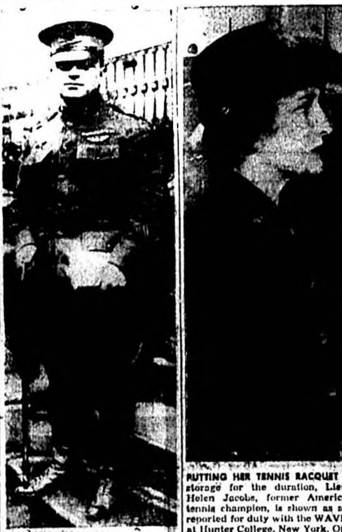
PUTTING HER TENNIS RACQUET in storage for the duration, Lieut. Helen Jacobs, former American tennis champion, is shown as she reported for duty with the WAVES at Hunter College, New York.