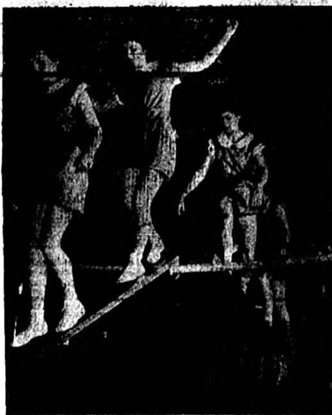
TRIPPING THE LIGHT FANTASTIC over the "balanced beam," these girls are undergoing the course of commando training which will ready them for the WAVES, WAACS, and SPARS. Part of the course at New York City College's School of Business, the training comprises discipline, drill and classroom periods in history and theory.