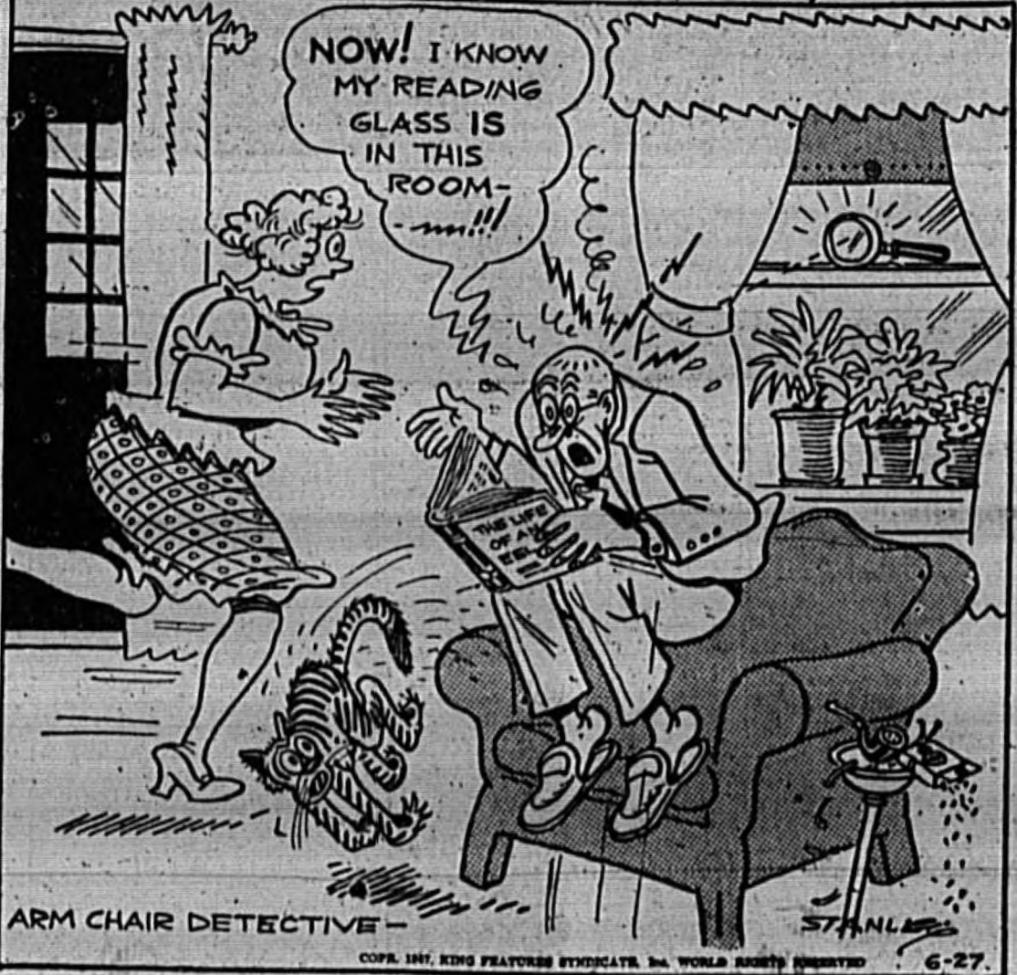
ARM CHAIR DETECTIVE - COPY. INT. KING FEATURES SYNDICATE, INC. WORLD WIDE DISTRIBUTION 6-27

Under certain conditions glass is as strong as iron.