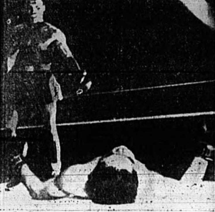
Challenger Jimmy Doyle lies flat on his back after a left to the jaw by welterweight champion Sugar Robinson just before the end of the eighth round in championship fight in Cleveland. Doyle is unable to answer the bell for the ninth round and died in Cleveland's Charity Hospital Wednesday.